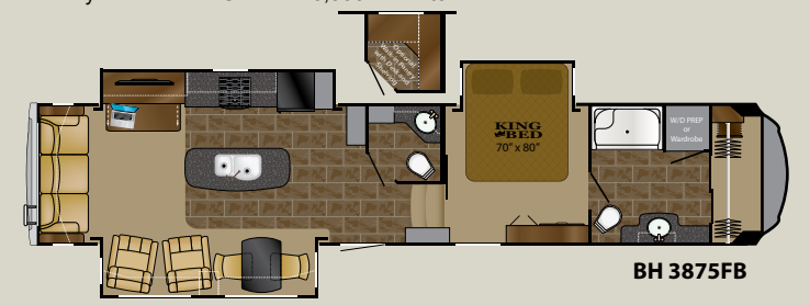
Length: 41' 9" Height: 13' 3" Dry: 13,350 GVWR: 16,000 Hitch: 3,010