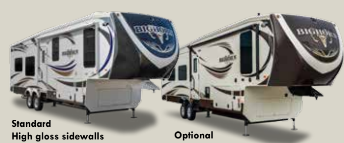
High gloss sidewalls with painted front cap lvory high gloss sidewalls with painted front and rear cap