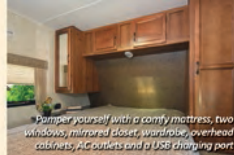
Pamper yourself with a comfy mattress, two windows, mirrored closet, wardrobe, overhead cabinets, AC outlets and a USB charging port