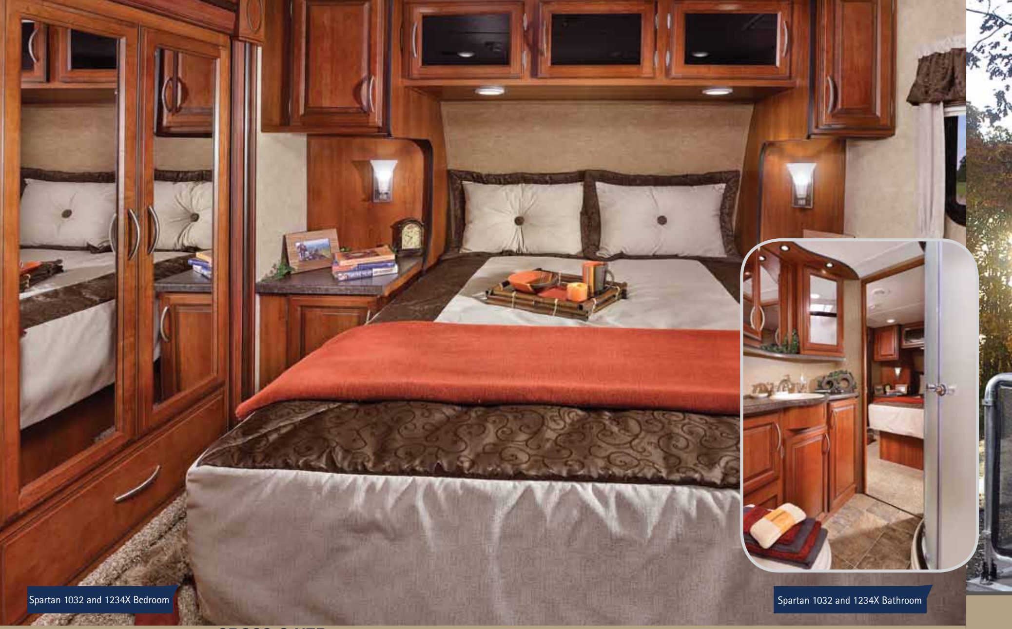
» CROSS-O-VER: Noun; An Adaptation In Style Or Design Intended To Appeal To A Wider Audience

From the first impression to the last detail, Spartan cut no corners when creating the bedroom and bathroom. Every aspect of these spaces has been carefully thought out and executed perfectly. In the bedroom, you'll find oversized wardrobe closets, chest of drawers, HUGE overhead cabinets, and massive walk ways that create optimal space and comfort that surpasses anything in its class. And rest assured you'll find a great night's sleep on the 80" Denver Mattress ® pillow top bed.