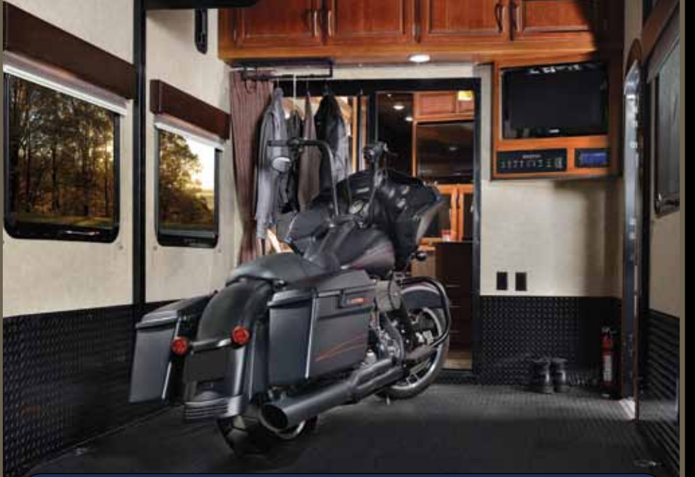
The garage is intelligently designed with 22" Black Diamond wall covering, gas/oil resistant flooring, perimeter steel tie down rings that are BOLTED to the chassis, and 1" floor decking with 3000# weight capacity.