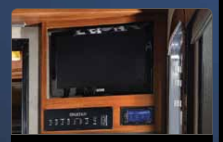
Hi Power Sony Stereo W/DVD Player, Speakers & Exterior Sony Audio Sound Control