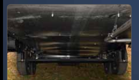
Thermal Package Plus Provides For Extended Season Enjoyment