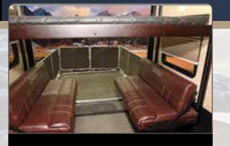
Happi-Jack Electric Bed & Double Sofa/Bed