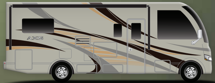
NIGHT LIFE HD-MAX™