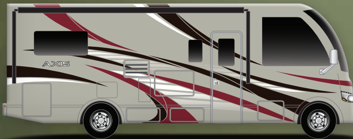
FAST LANE HD-MAX™