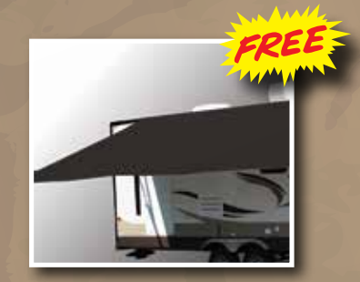
Power Electric Awning