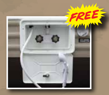
Outside Shower with Hot and Cold Controls