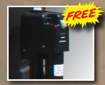
Power Tongue Jack