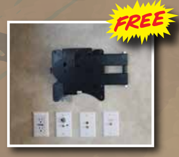
Swing Arm TV bracket