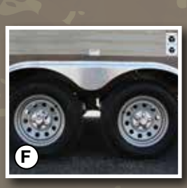
Catalina's exclusive tire and rim package includes: radial tires, polished aluminum fender skirts and e-coat rims