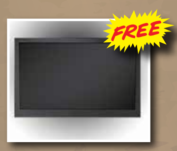
26" Flat Screen TV