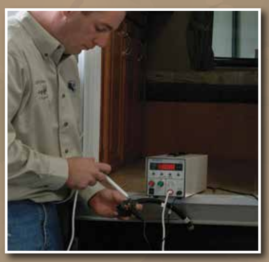
A thorough electrical check makes sure that all electrical components are in working order, and that no electrical connections have been compromised during construction.