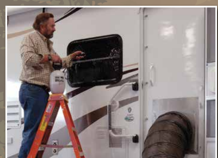
When checking for water leaks we pressurize the unit and then use a Seal-Tech spray on every part of the unit to identify any problem areas.

All of our craftsman are thoroughly trained to use a framing table with jigs and clamps. This ensures that the cabinets are built to extremely tight tolerances for tight and secure cabinetry that will last for years.