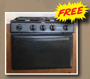
Range with Oven IPO 3 Burner Cooktop