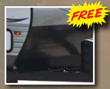
Front Diamond Plate Stone Guard