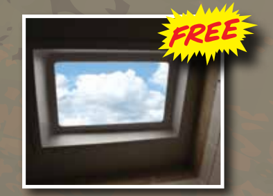
Skylight Above Tub/Shower