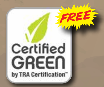
TRA GOLD Certification