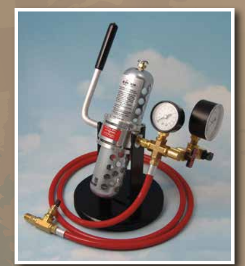
A pressurized LP line test ensures that your unit is safe and all LP gas components are in working order.