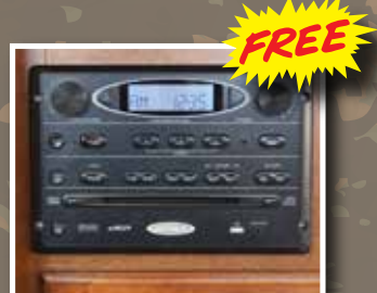
Multi Media Sound System w/ DVD and CD radio