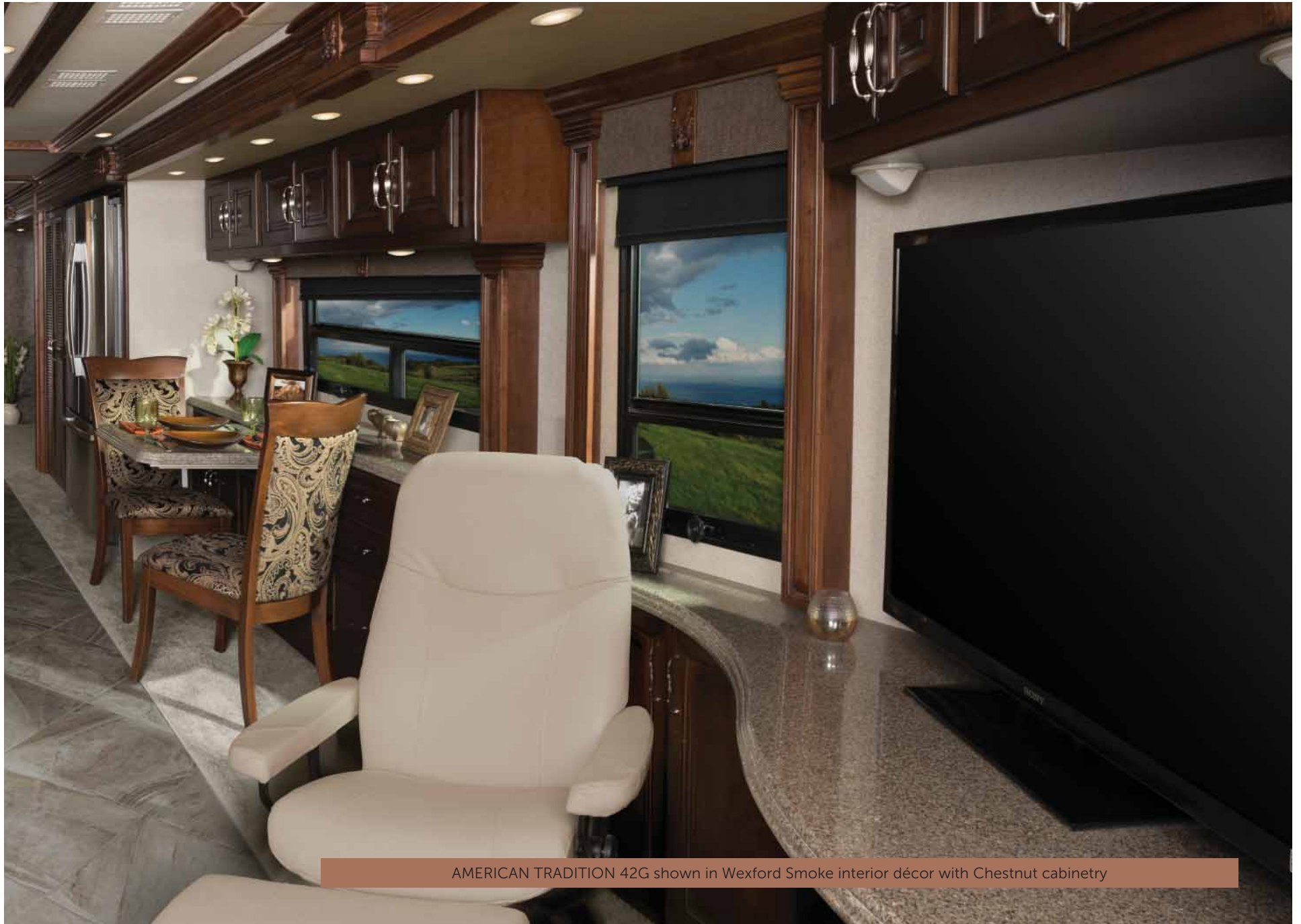
AMERICAN TRADITION 42G shown in Wexford Smoke interior décor with Chestnut cabinetry