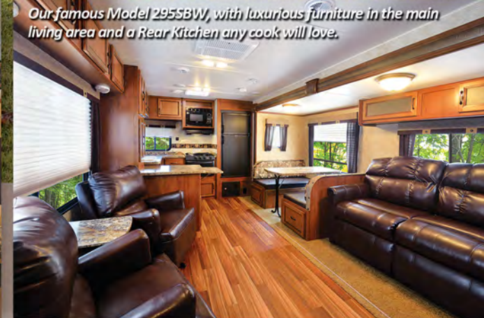
Our famous Model 295SBW, with luxurious furniture in the main living area and a Rear Kitchen any cook will love.