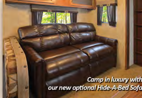
Camp in luxury with our new optional Hide-A-Bed Sofa