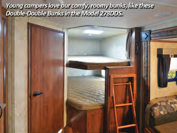
Young campers love our comfy, roomy bunks, like these Double-Double Bunks in the Model 278DDS.