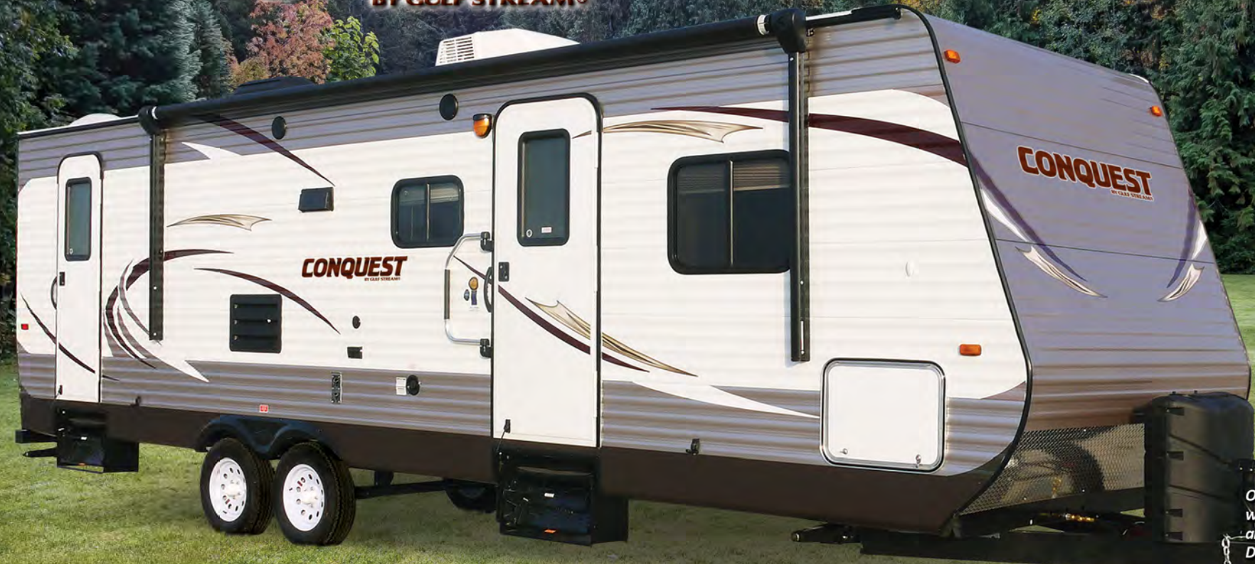
Our New 277DLS with Double Bunks and two Entry Doors