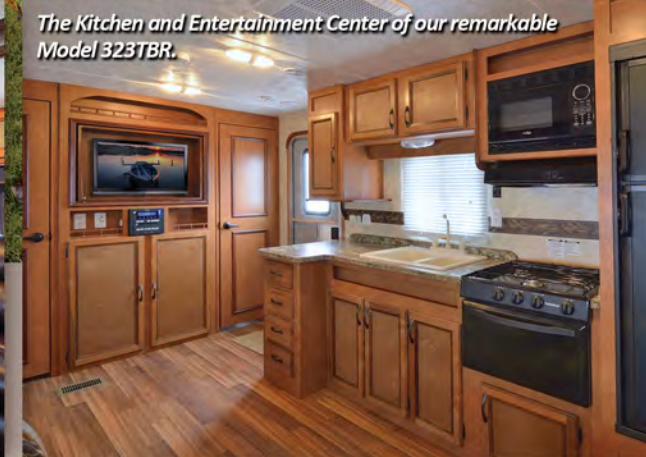
The Kitchen and Entertainment Center of our remarkable Model 323TBR.