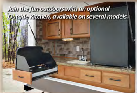
Join the fun outdoors with an optional Outside Kitchen, available on several models.