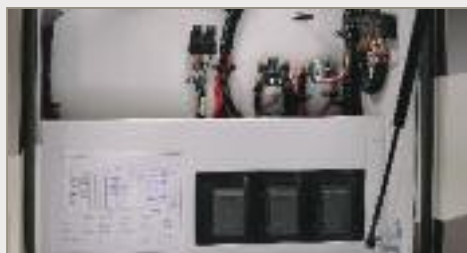
Easily access electrical fuses with Berkshire's no fuss schematic.