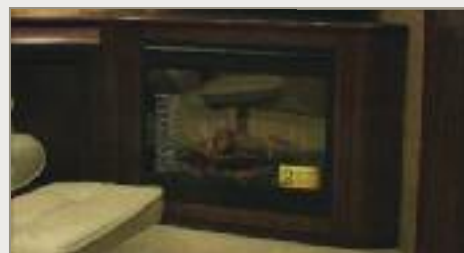
Optional fireplace (N/A 390 BH)