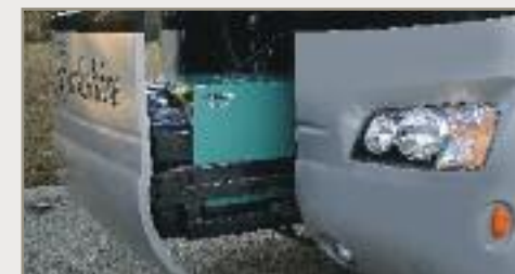
Generator slide tray