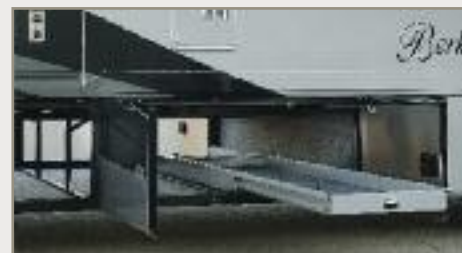
Standard suicide compartment doors with pass-thru storage and optional slide-out storage tray