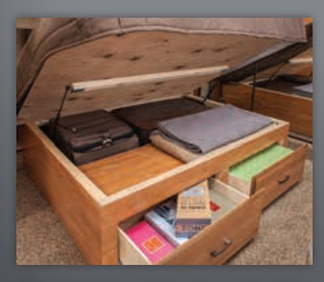
The storage continues under the bed, including large built-in storage drawers