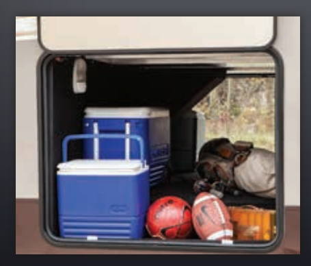
With Phoenix's generous pass -through storage, there's room for everything