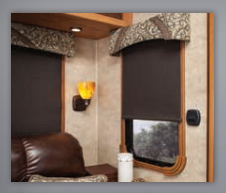
Standard luxury items like window roller shades and wood-trimmed windows throughout