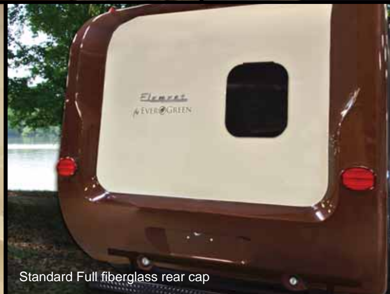
Standard Full fiberglass rear cap