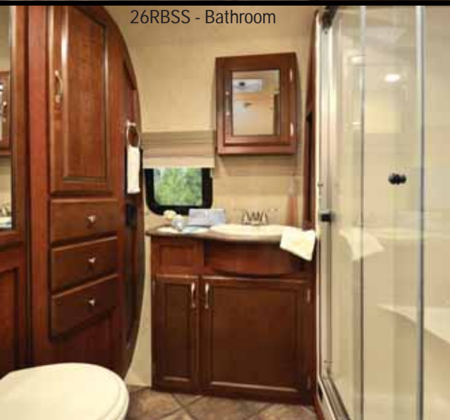
26RBSS - Bathroom