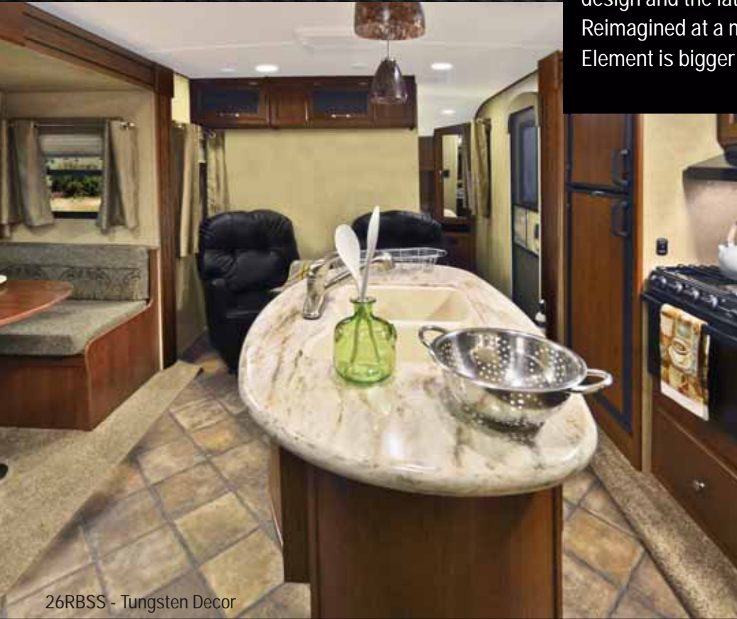
26RBSS - Tungsten Decor

The new Element is a fusion of classic American design and the latest in automotive aerodynamics. Reimagined at a more affordable price, the new Element is bigger and better than ever.