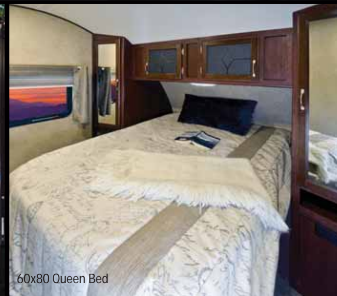
60x80 Queen Bed