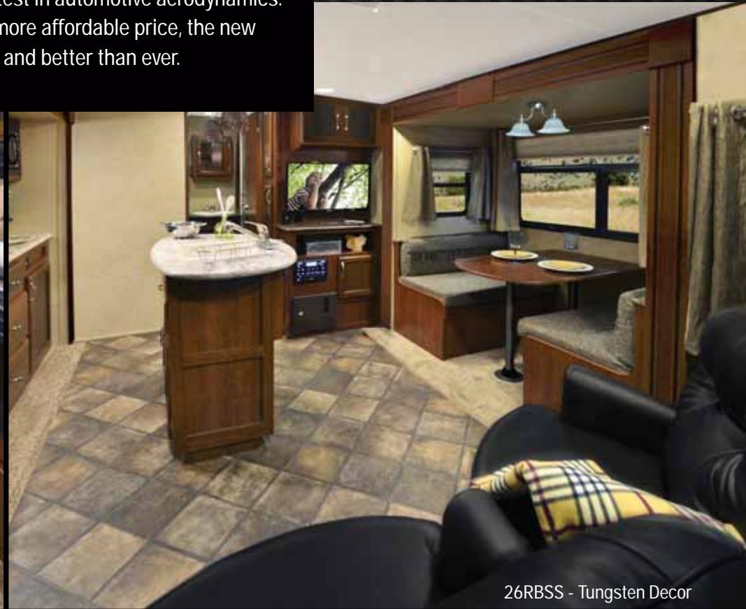
26RBSS - Tungsten Decor