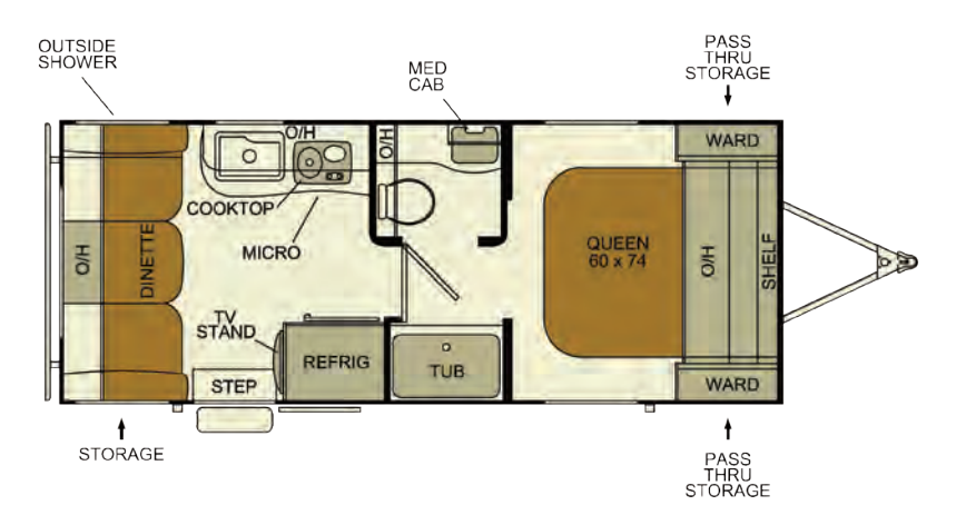
Furniture Features Linoleum