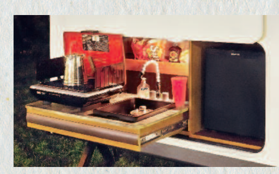
Relax outside and grill your favorite foods with our optional camp kitchen, available on 268BHS and 298BHS models.