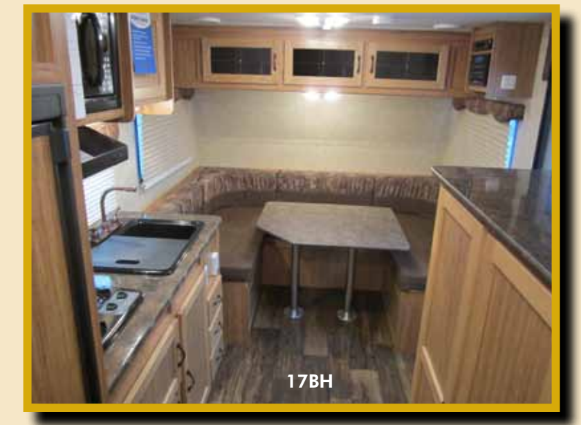
Skyline's exclusive Tow-Lite Technology is the use of ultra lite-weight materials to assemble a more aerodynamic trailer which may be towed by smaller, more fuel-efficient vehicles than conventionallyconstructed trailers.