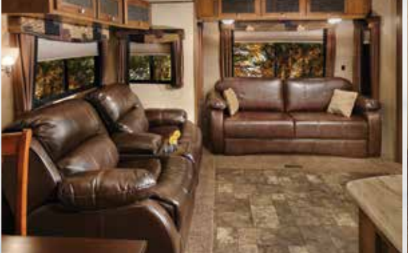
Great movie viewing for everyone from the optional 80" sofa and theatre seating.