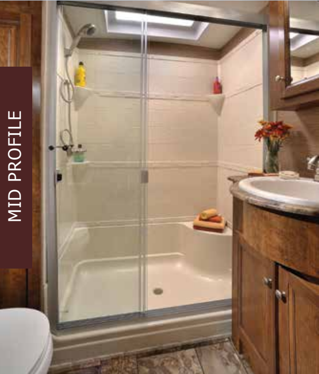
Standard oversized glass shower (329MKS, 360IBL).

The Mid Profile has been the flagship product for the Chaparral brand for over a decade. Chaparral Mids come well-equipped with features not found in our competitors, such as residential features throughout the coach including non-air mattress hide-a-bed sleeper sofas, Serta® mattresses and optional La-Z-Boy® recliners. You will find elegant interiors that surround you with a home-like feel in Chaparral.