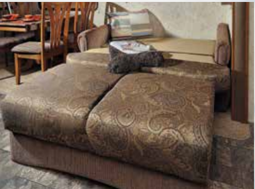
Magic Night Sleep System sofa for a better night's sleep without the hassle of a leaky air mattress.