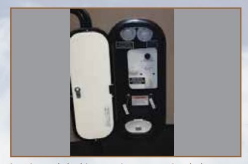
A universal docking station conveniently houses, in one location, items such as city water hookup, fresh water fill, cable TV hook-up and black tank flush.