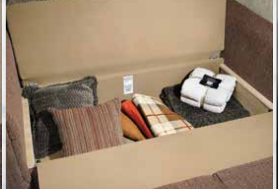
Extra storage space under the sofa keeps extra blankets and pillows hidden away.