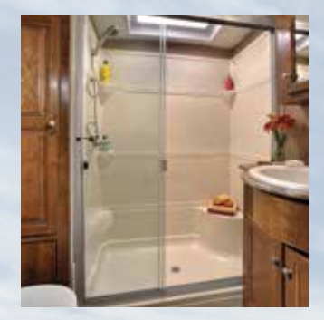
Residential walk-in shower (29BHS, 29MKS, 29RKS).

We believe that a natural towing experience — one in which you can forget that you are actually pulling something — can be achieved through great aerodynamics and light weights. Our combination of Alumicage construction and Turn Tec Engineering has taken towability to a whole new level. Chaparral Lite fifth wheels are available in single, double and triple slide-out floorplans that have been designed for today's ½ ton pickup trucks and people that enjoy the RV lifestyle.