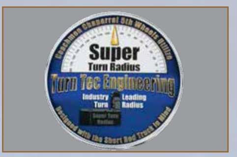
All of our Chaparral units have been designed with the short bed truck in mind.