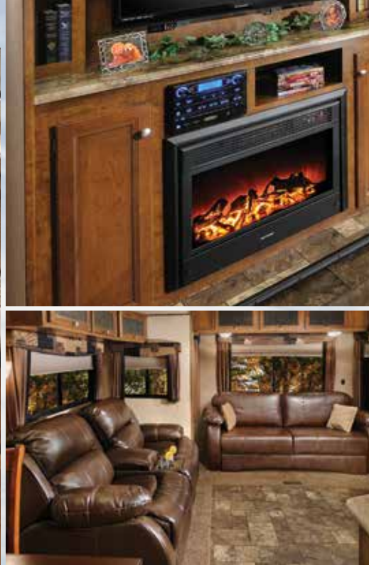
Great movie viewing for everyone from the optional 80" sofa and theatre seating.