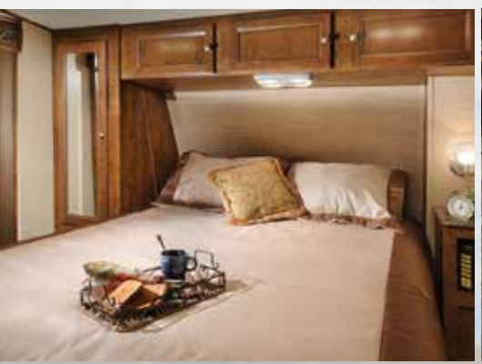
Model 29MKS bedroom with multiple storage areas, nightstand, overhead reading lights and Serta® pillow-top queen mattress.