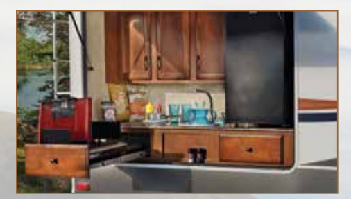
Our outside kitchen featuring a half-sized refrigerator, pull-out shelf with Coleman® grill and plenty of cabinet space.