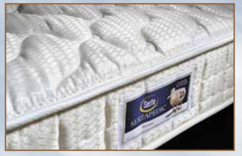
The Serta® pillow-top mattress provides a comfortable night's rest in the Chaparral.