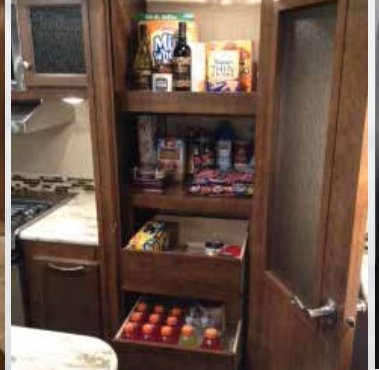
Enjoy a clutter-free countertop with items tucked neatly away in the spacious pantry.