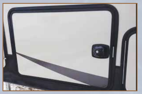
The bus-style slam latch baggage doors provide convenient and secure access to your cargo.