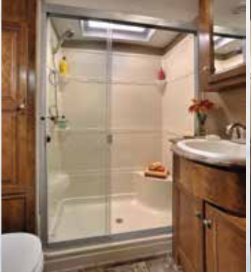
Standard oversized glass shower (331MKS, 343RLTS, 357BHS).