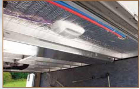
Astro-Foil insulation — insulates under our bed/bath decks and under our slide-out floors.