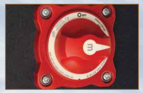
12 volt battery disconnect quickly and conveniently provides a quick shutdown.