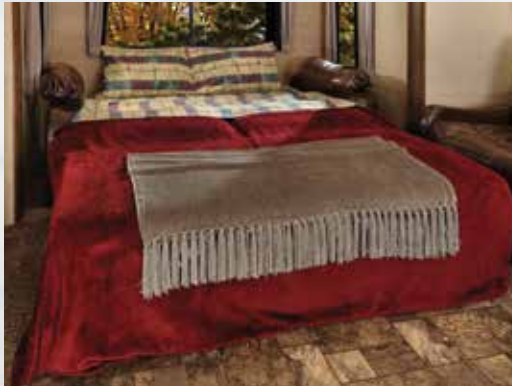
80" sofa converts to extra sleeping room for family or guests.