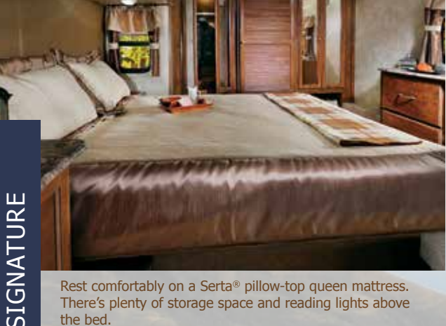
Rest comfortably on a Serta® pillow-top queen mattress. There's plenty of storage space and reading lights above the bed.