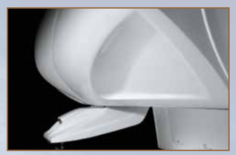
Coachmen Chaparral and its engineering team have developed one of the best front cap designs in the business! One look at our cap design and you will see how our turn radius is better.