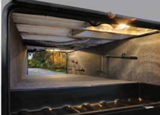
Pack Max Storage — larger pass thru storage and slam latch baggage doors.