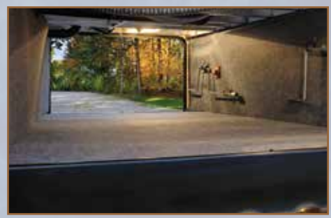
Pack Max Storage — larger pass thru storage and slam latch baggage doors.