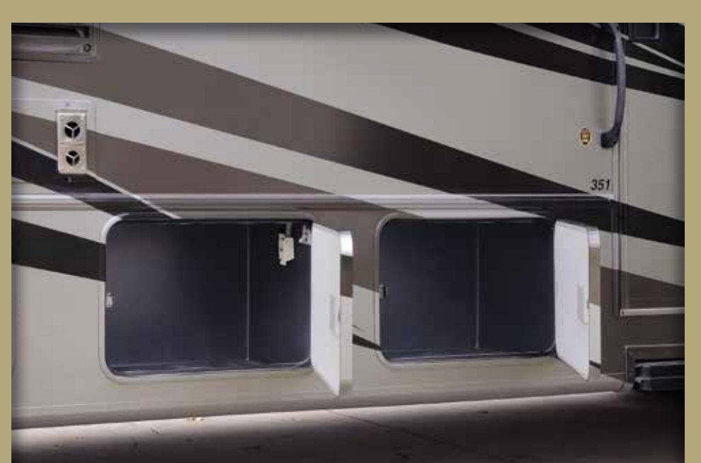
Heavy roto cast storage compartments Side hinges with easy to close latches

Whether you are leaving for the weekend or the season Georgetown will deliver a truly enjoyable experience.