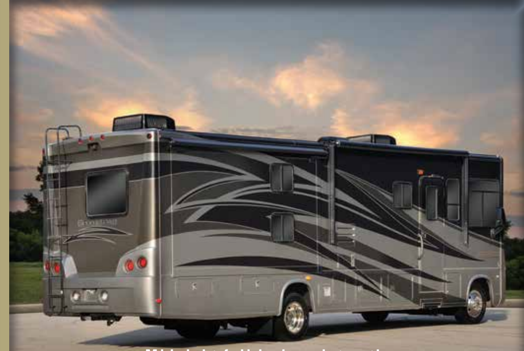
Midnight full body paint option

Inside and out the Georgetown is both beautiful and functional. Six exterior options give you the opportunity to express yourself while you travel. Four interior options give you the opportunity to express yourself to your guests in your living quarters. Georgetown gives you the true freedom to design a motorhome built to suit your lifestyle.