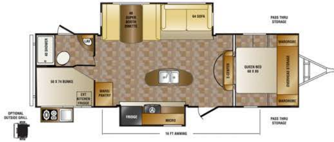
HCT28BH — TRAVEL TRAILER