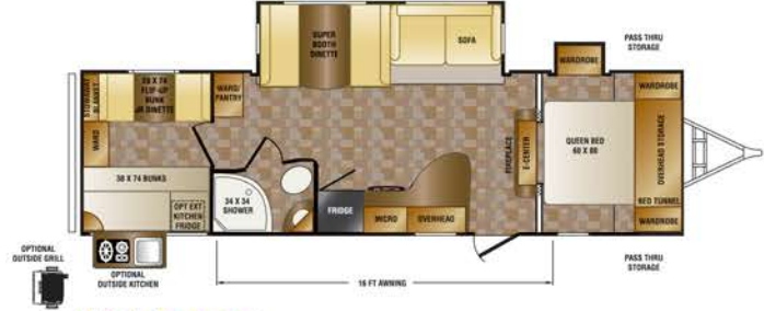
HCT29SS — TRAVEL TRAILER