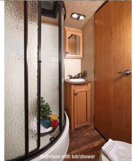
Bathroom with tub/shower