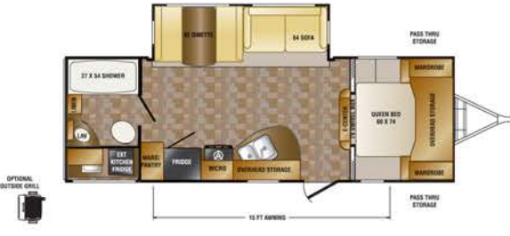
HCT250RB — TRAVEL TRAILER