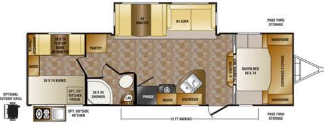
HCT290QB — TRAVEL TRAILER