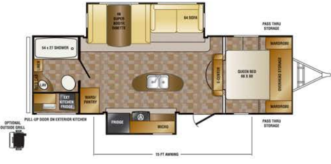
HCT26RB — TRAVEL TRAILER