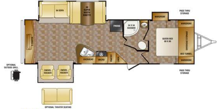
HCT30RE — TRAVEL TRAILER