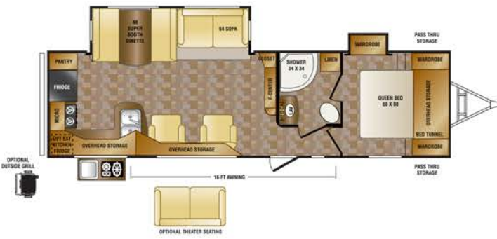
HCT30RK — TRAVEL TRAILER