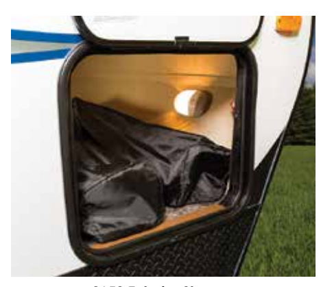
2650 Exterior Storage