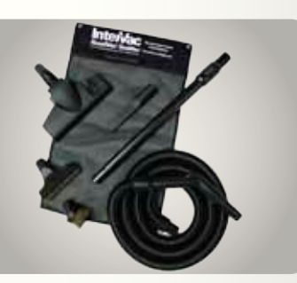
16. CENTRAL VACUUM