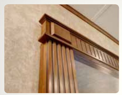
01. SOLID HARDWOOD SLIDE-OUT FASCIA