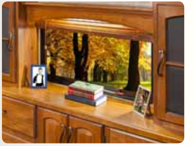
09. NEW BEDROOM DRESSER & ARMOIRE W/RESIDENTIAL WOOD BLINDS