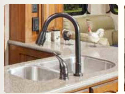
05. 70/30 STAINLESS STEEL KITCHEN SINK