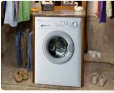
12. WASHER/DRYER PREP