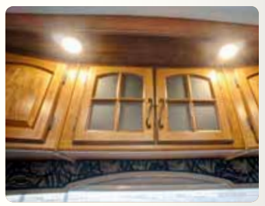
OB. HAND LAID MULLION CABINET DOORS IN LIVING AREA & BEDROOM