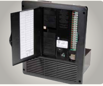
14. 90 AMP INTELI-POWER 4500 CONVERTER