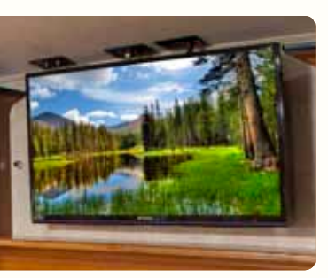
10. BEDROOM 32" HD FLAT PANEL TV