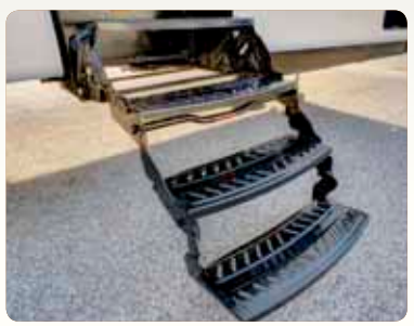
02. FOUR STEP ENTRY