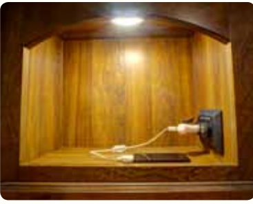
11. BEDROOM CELLPHONE CHARGING STATION