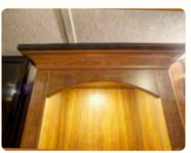
07. ELEGANT CROWN MOLDING ABOVE THE KITCHEN & BEDROOM CABINETS