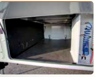
13. ENORMOUS DROP FRAME PASS THRU STORAGE COMPARTMENT