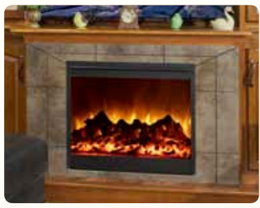
15. ELECTRIC FIREPLACE