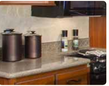
06. ROYAL ENTOURAGE CORIAN COUNTERTOPS & CORIAN KITCHEN BACKSPLASH