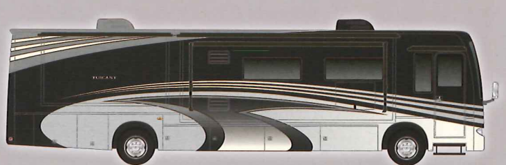
STORM SHADOW FULL BODY PAINT