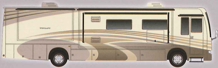
BURLED BEACH FULL BODY PAINT