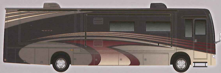
MIDNIGHT EMBER FULL BODY PAINT