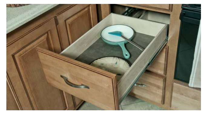
Full-Extension Drawer Slides make it easy to open drawers wide and maximize their storage space.