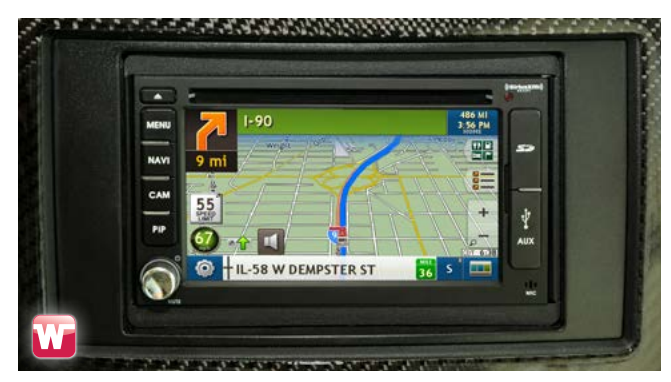
The available Infotainment Center with Rand McNally RV GPS offers turn-by-turn voice guidance and more.