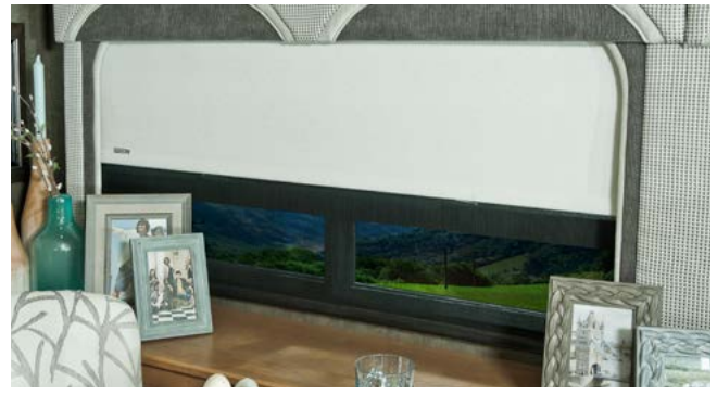
Adjust your preferred light and privacy settings with the smoothoperating MCD Solar/Blackout Roller Shades.