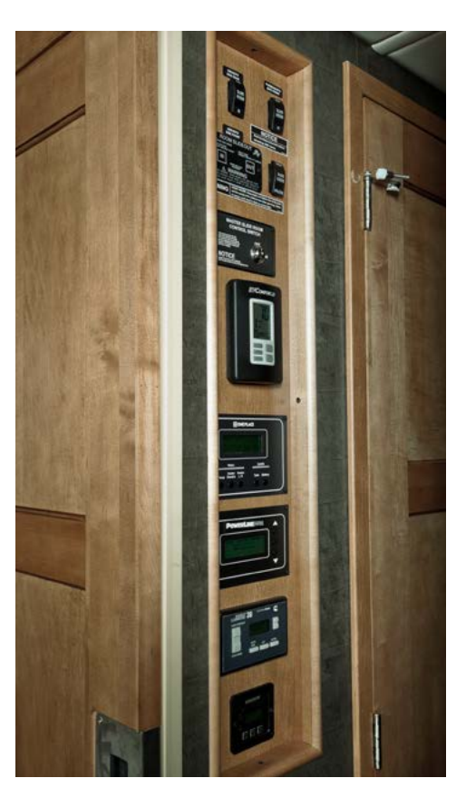
The OnePlace<sup>®</sup> Systems Center lets you monitor and control key systems from one convenient location.

Click on this icon throughout the brochure to link to more information on the web.