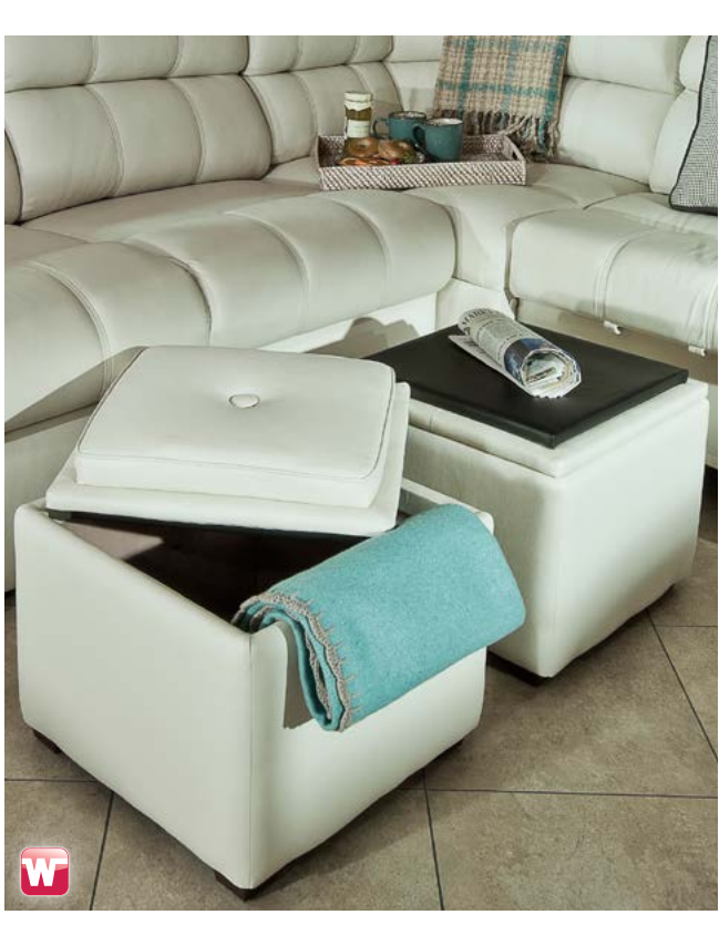
Choose a set of two plush Ottomans for extra storage and seating or to rest your legs while relaxing on your sofa (38Q).