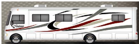
STANDARD PURSUIT GRAPHICS

Entry Door with Deadbolt Lock Systems Control Center Smoke Detector LP Gas Detector Fire Extinguisher Outside Receptacle Emergency Start Switch Patio Light