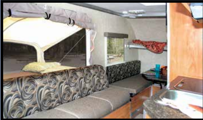
Pictured with optional front overhead bunk and side tip-out bunk.