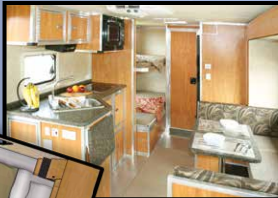
Pictured with optional convection microwave.