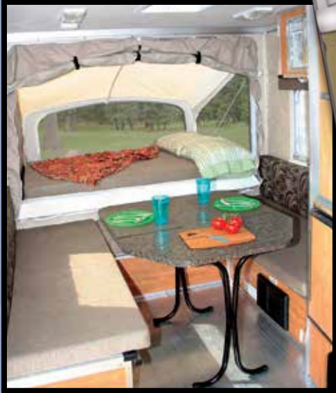
Pictured with optional rear tip-out bunk.