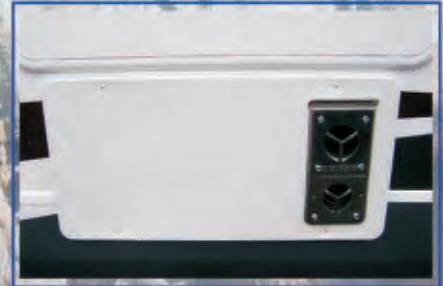
15% Larger XL Furnace (Extreme Camping Heat System)