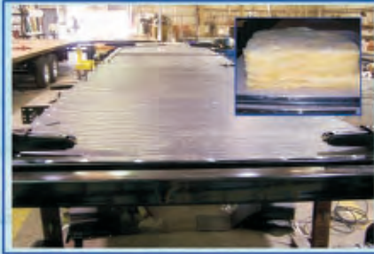
Fully Enclosed Front to Back Heated Insulated Underbelly Double Mountain Floor Insulation