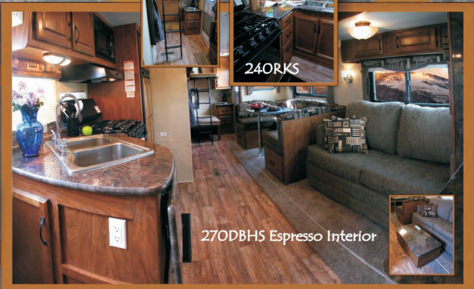
27ODBHS Espresso Interior