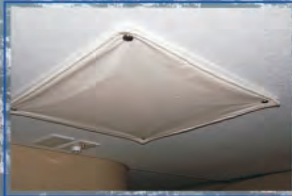
Insulated Snap Cover for Bedroom Roof Vent