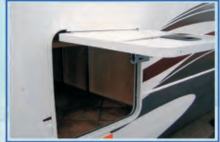
1" Thick Thermal Insulated Luggage Door Compartments