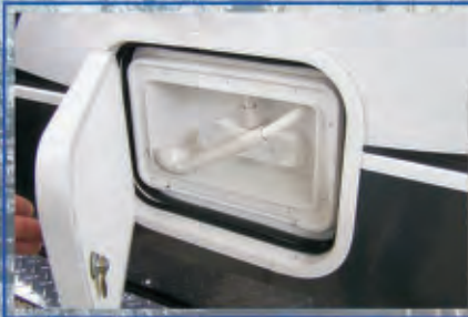
Exterior Shower Insulated by 1" Thick Thermal Insulated Luggage Door