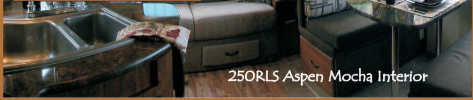
25ORLS Aspen Mocha Interior

REAR PICTURE WINDOW S- For 2013 we have three floorplans with this window arrangement, two of these are shown above (25ORLS, 26ORLS). Two comfortable swivel rocker chairs, a sofa, or a Family Sized U-Shaped Dinette (25ORDS), you choose which floorplan best fits your RV lifestyle. From the two tone day/night shades to the 26" - 32" 12V HD LED TV's with Home Theatre System (DVD player, surround sound ceiling speakers, premium exterior speakers, and sub-woofer) - simply put this is how you should enjoy the "Outdoors" with your family.