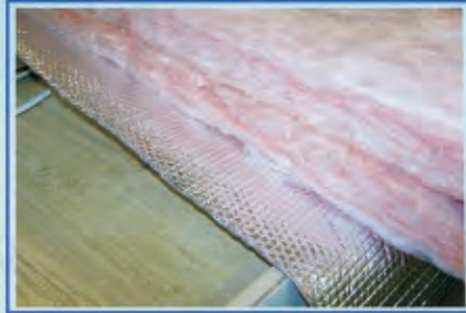
Triple Layered Four Seasons Roof Insulation

Climate Designed - Four Seasons Camping - Designed for Mountain States & Western Canada