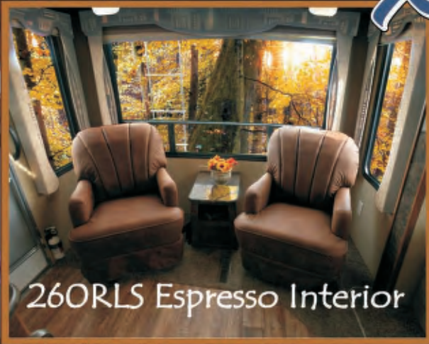
26ORLS Espresso Interior