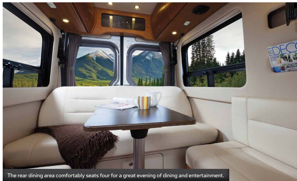
The rear dining area comfortably seats four for a great evening of dining and entertainment.

www.leisurevans.com For more photos, videos, virtual tours & more.