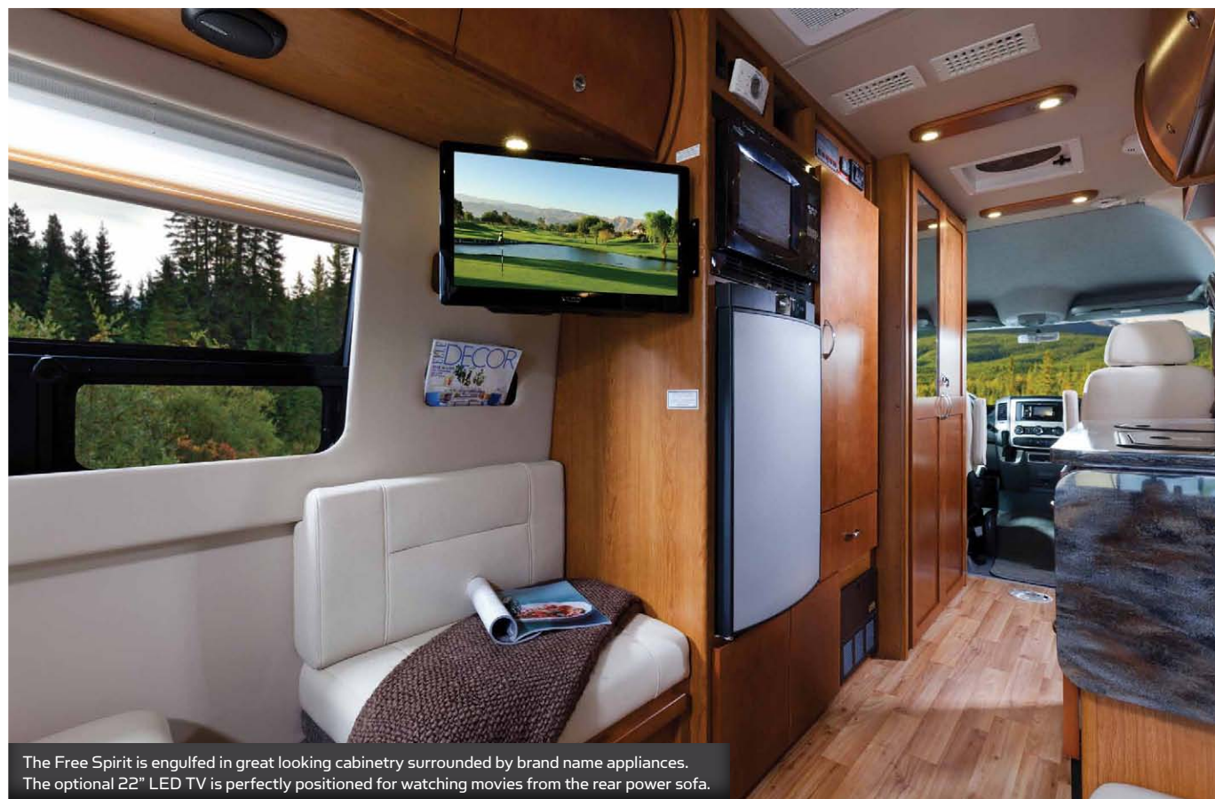
The Free Spirit is engulfed in great looking cabinetry surrounded by brand name appliances. The optional 22" LED TV is perfectly positioned for watching movies from the rear power sofa.