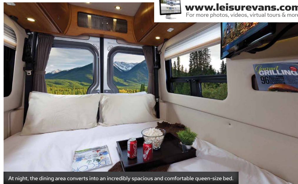
At night, the dining area converts into an incredibly spacious and comfortable queen-size bed.