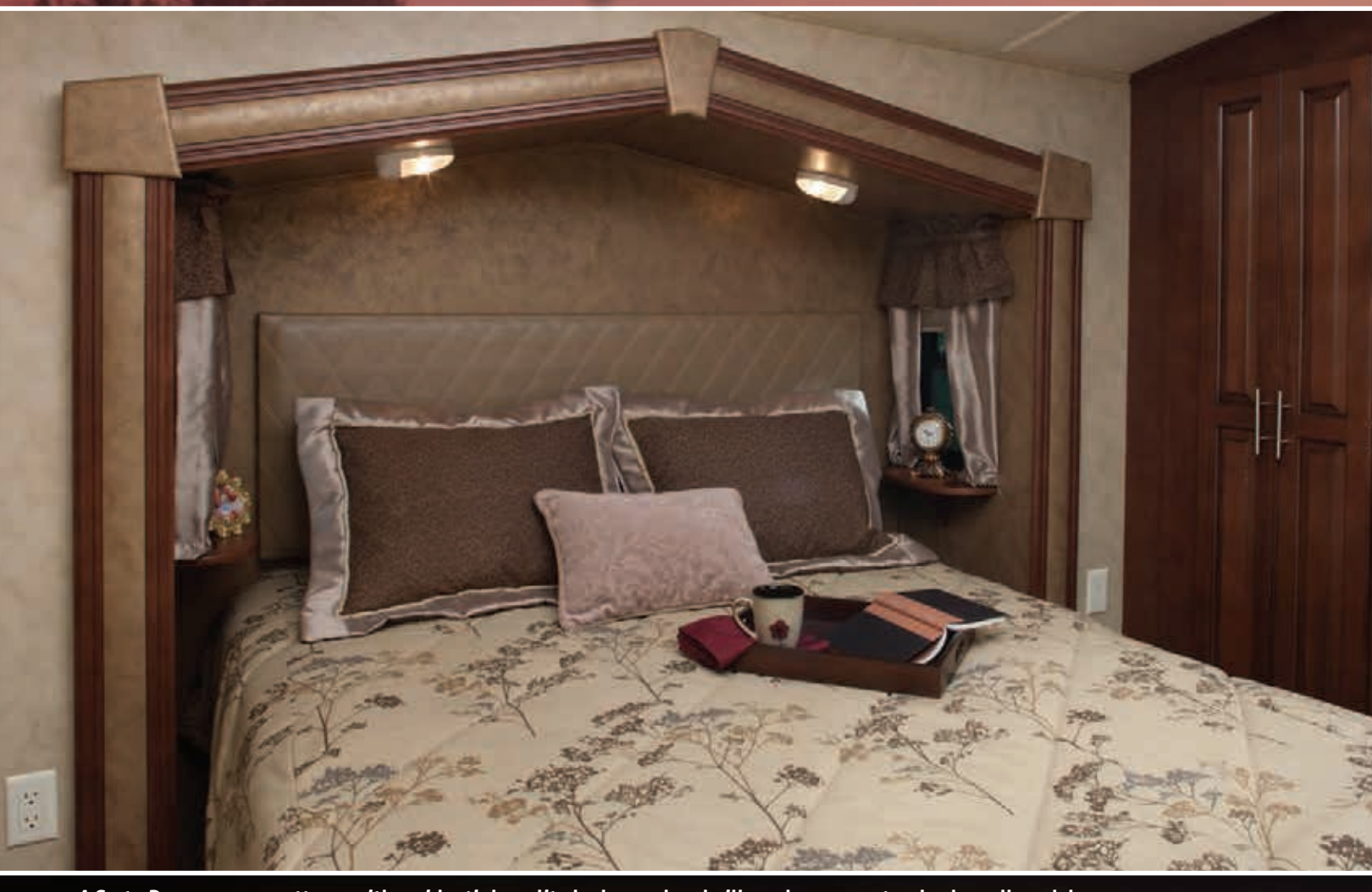
A Serta Dreamscape mattress with residential quality bedspread and pillow shams are standard on all models.

Silverback's bathroom includes a large sink, countertop and a double stack medicine/towel cabinet.