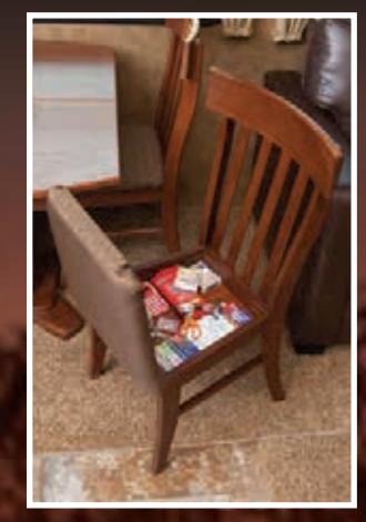
Our standard freestanding table with extension includes four dinette chairs with hidden storage under the seat. (35FL has two.)