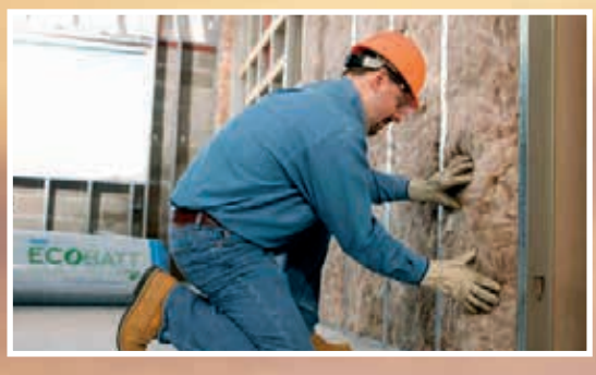
Residential, glasswool insulation designed by nature