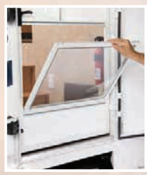
Removable "Soft Top" Vinyl Storm Doors allow light and visibility without losing cooling or heating.