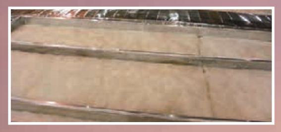
2" x 3" Aluminum floor studs