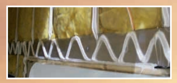
Thick Silaprene (475 PSI) guarantees solid contact between the gelcoat and aluminum frame without lamination