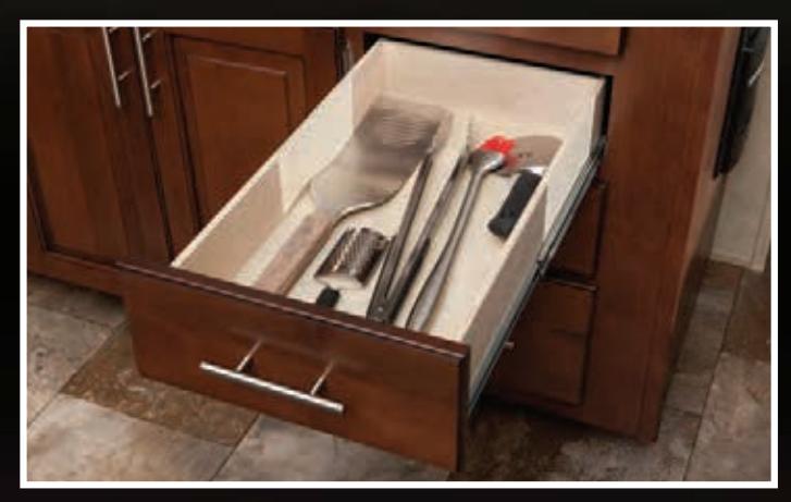
22" Deep full extension drawers where applicable.