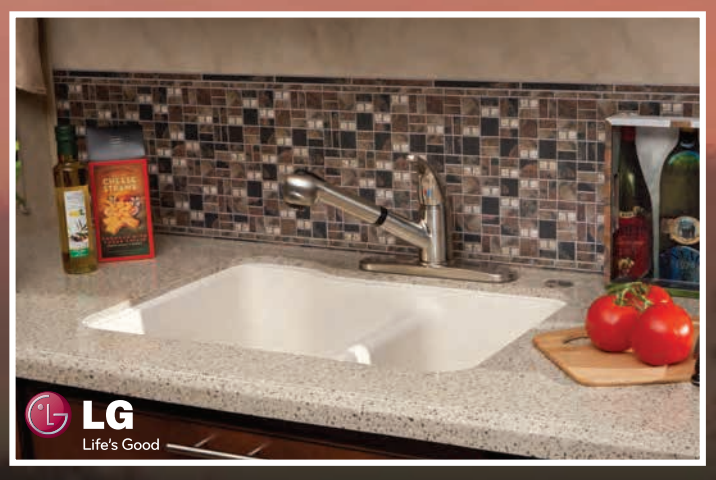
LG HI-MACS® kitchen countertops are durable and provide lasting beauty. Standard sink covers and large capacity sinks are complemented with a decorative splash guard.