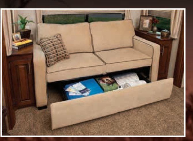
The hide-a-bed air mattress sofa includes a handy storage drawer.