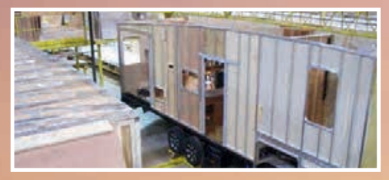
Aluminum studded sidewalls and roof trusses on 16" centers or less