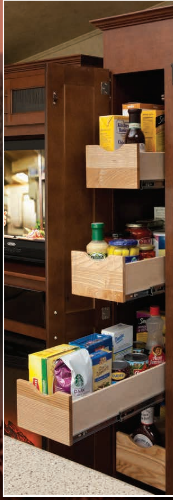
Space-saving slide out pantry storage drawers. (Available only on 33RL.)