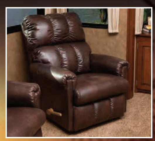
Live life comfortably with our standard La-Z-Boy® Reclina-Rockers. Choose from Fabric, Gunslinger microfiber or True Leather. (Lifetime warranty on parts – N/A 35QB4)