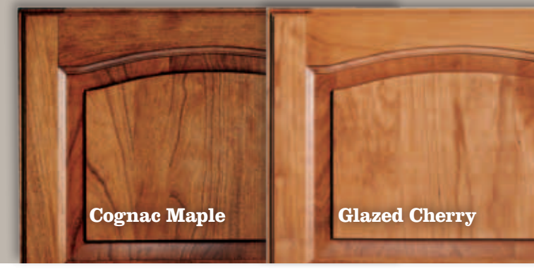
Décor selections are subject to change throughout the model year. Please visit your Sportscoach dealer or www.Sportscoachrv.com for current décor availability.