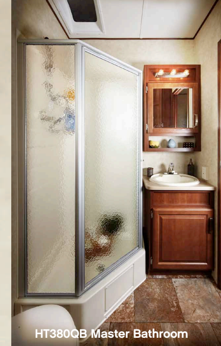
HT380QB Master Bathroom