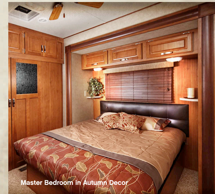
Master Bedroom in Autumn Decor

STYLE, CONVENIENCE AND PEACE OF MIND ARE DESIGNED INTO EVERY HAMPTON UNIT.