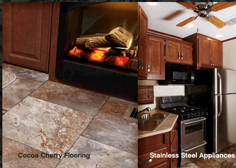
Cocoa Cherry Flooring