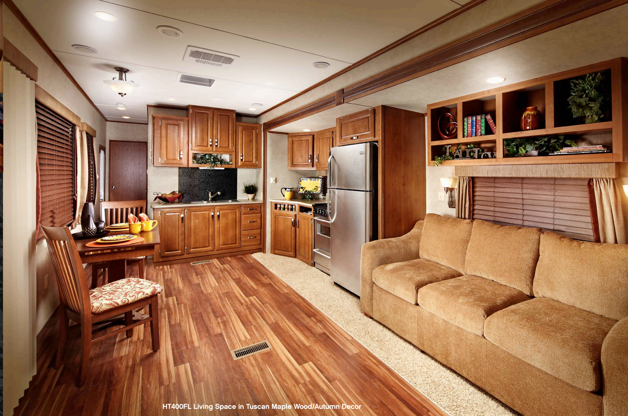
HT400FL Living Space in Tuscan Maple Wood/Autumn Decor