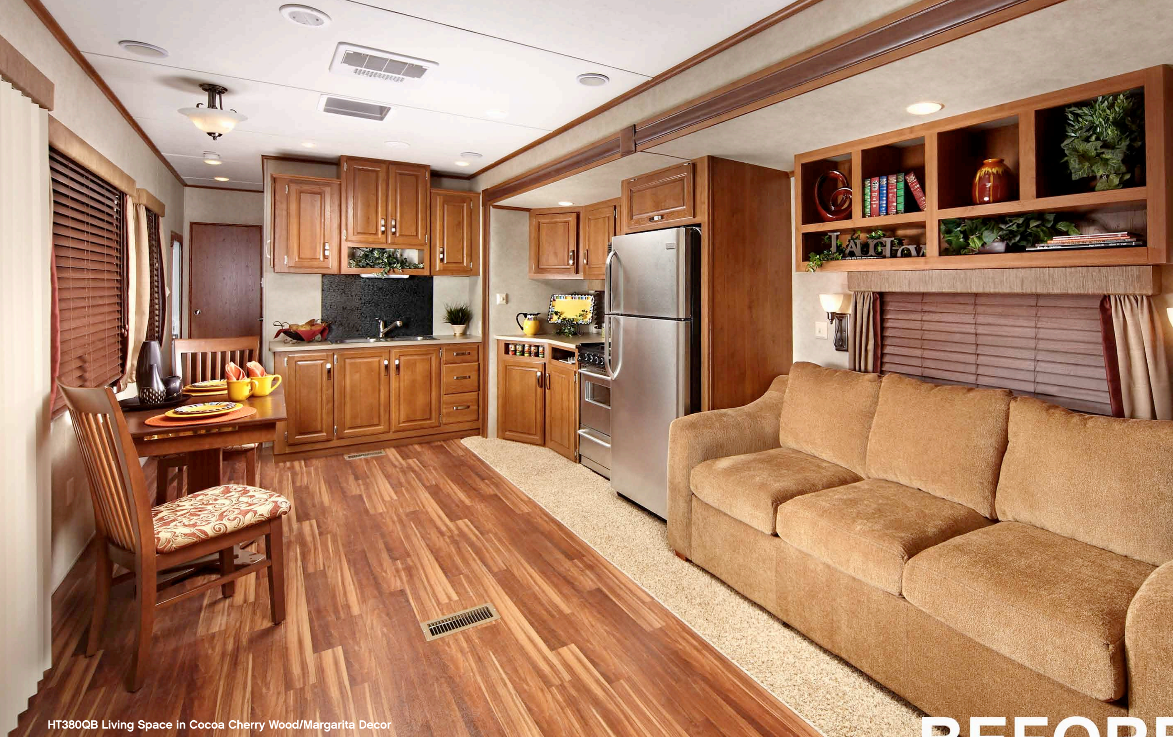
HT380QB Living Space in Cocoa Cherry Wood/Margarita Decor