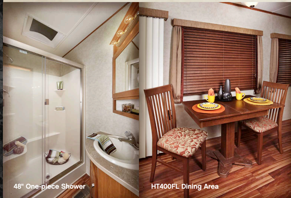
48" One-piece Shower