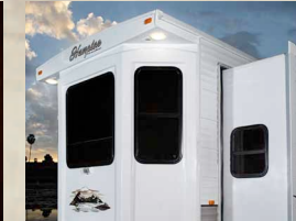
One-piece Molded Front Cap