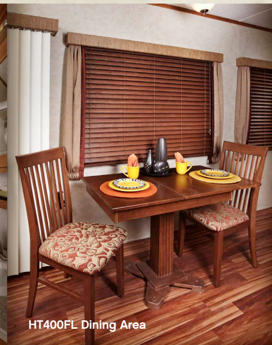
HT400FL Dining Area