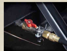
Reversible Main Shut-off