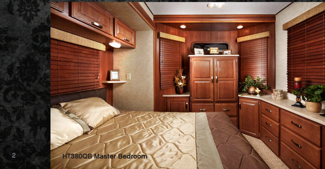
HT380QB Master Bedroom