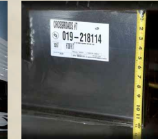
12" I-beam Construction