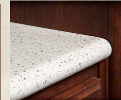
Optional Solid Surface Counters