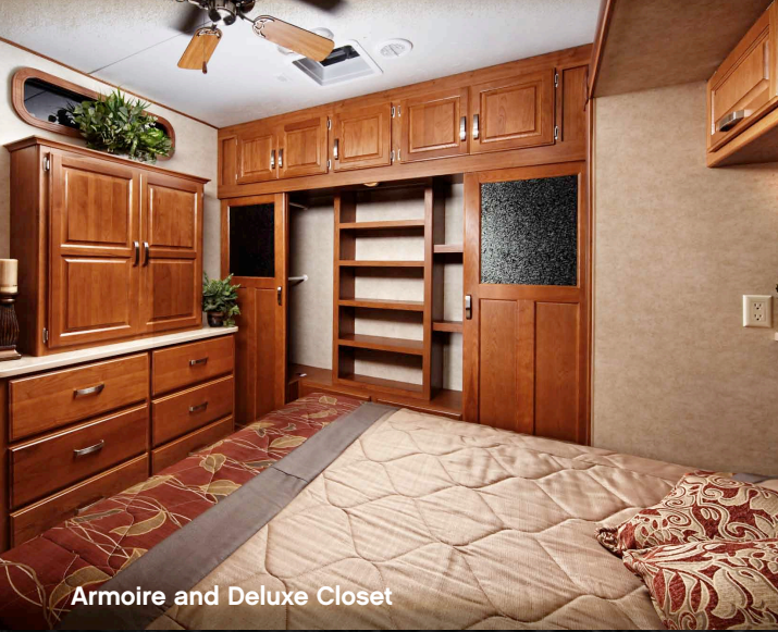
Armoire and Deluxe Closet