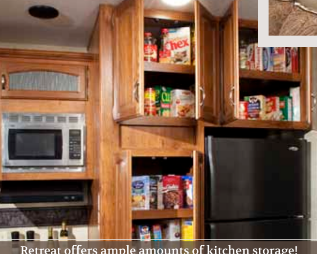
Retreat offers ample amounts of kitchen storage!