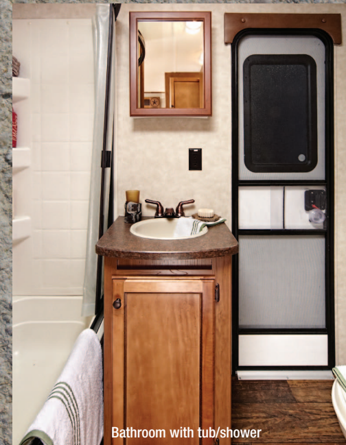
Bathroom with tub/shower