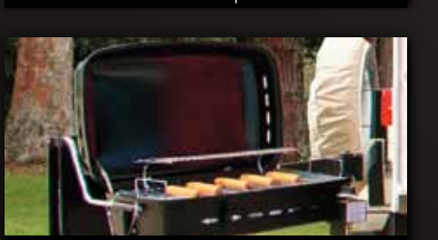
Optional Bumper Mounted Swing Arm Grill