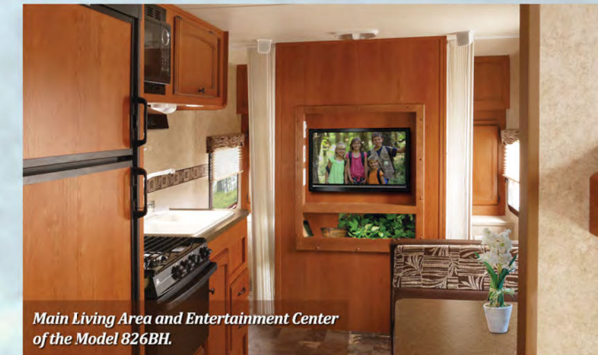
Main Living Area and Entertainment Center of the Model 826BH.