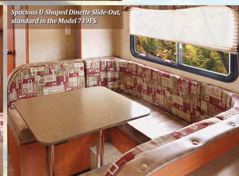
Spacious U-Shaped Dinette Slide-Out, standard in the Model 719FS