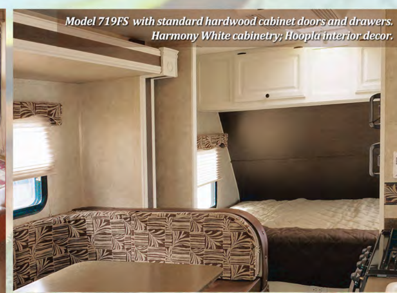
Model 719FS with standard hardwood cabinet doors and drawers. Harmony White cabinetry; Hoopla interior decor.