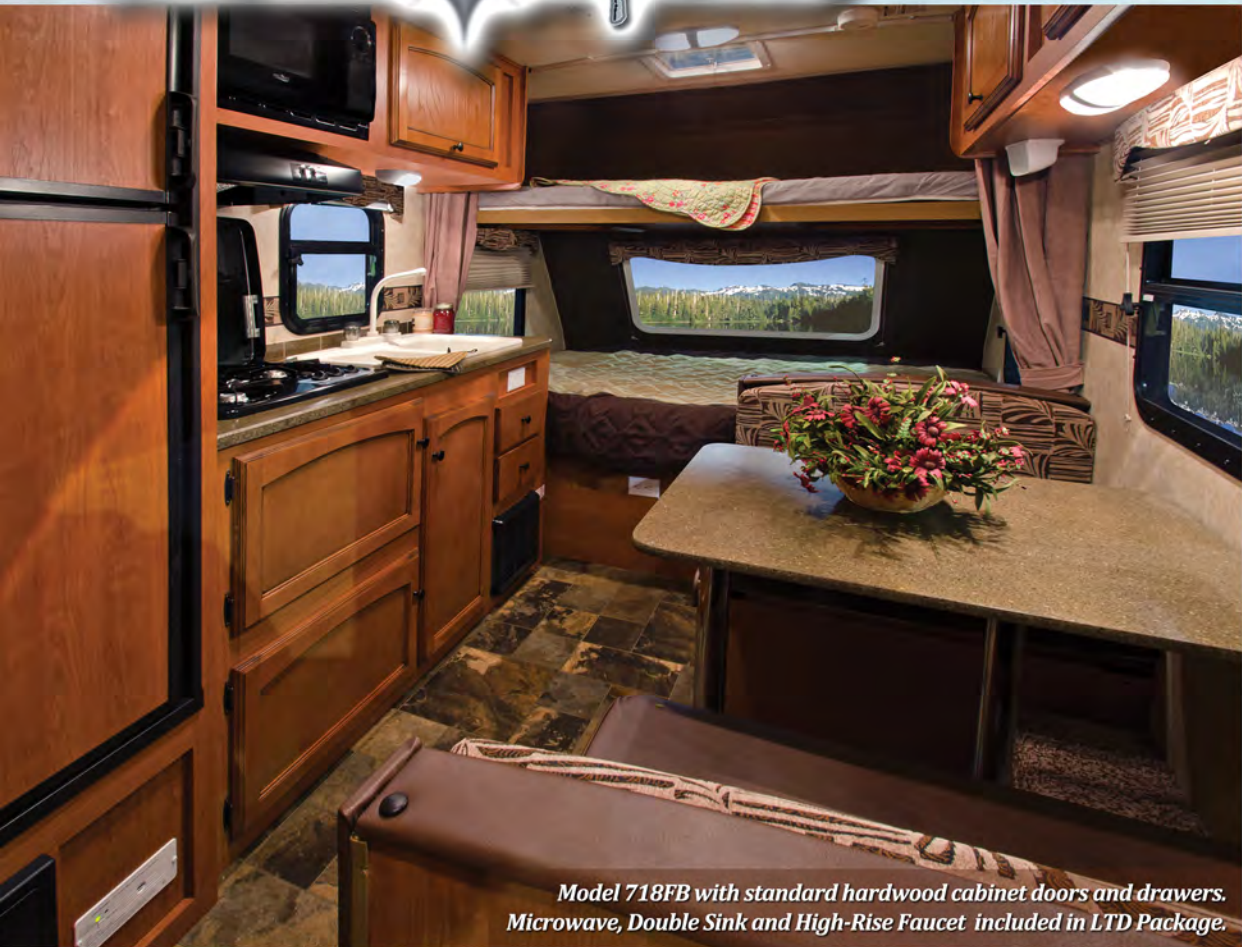
Model 718FB with standard hardwood cabinet doors and drawers. Microwave, Double Sink and High-Rise Faucet included in LTD Package.