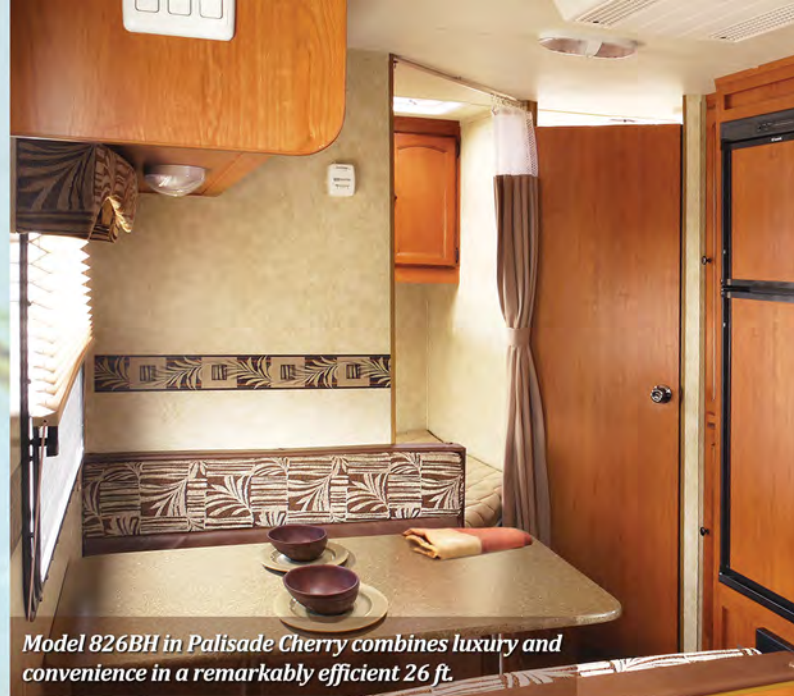
Model 826BH in Palisade Cherry combines luxury and convenience in a remarkably efficient 26 ft.