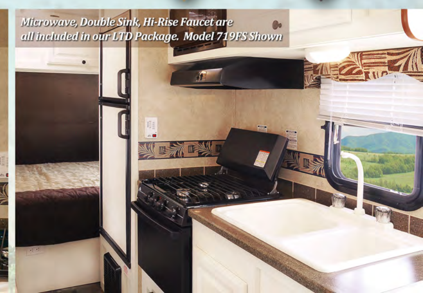
Microwave, Double Sink, Hi-Rise Faucet are all included in our LTD Package. Model 719FS Shown