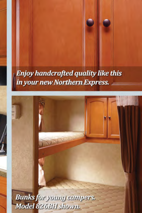
Enjoy handcrafted quality like this in your new Northern Express.