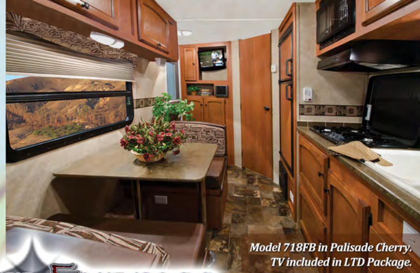
Model 718FB in Palisade Cherry. TV included in LTD Package.