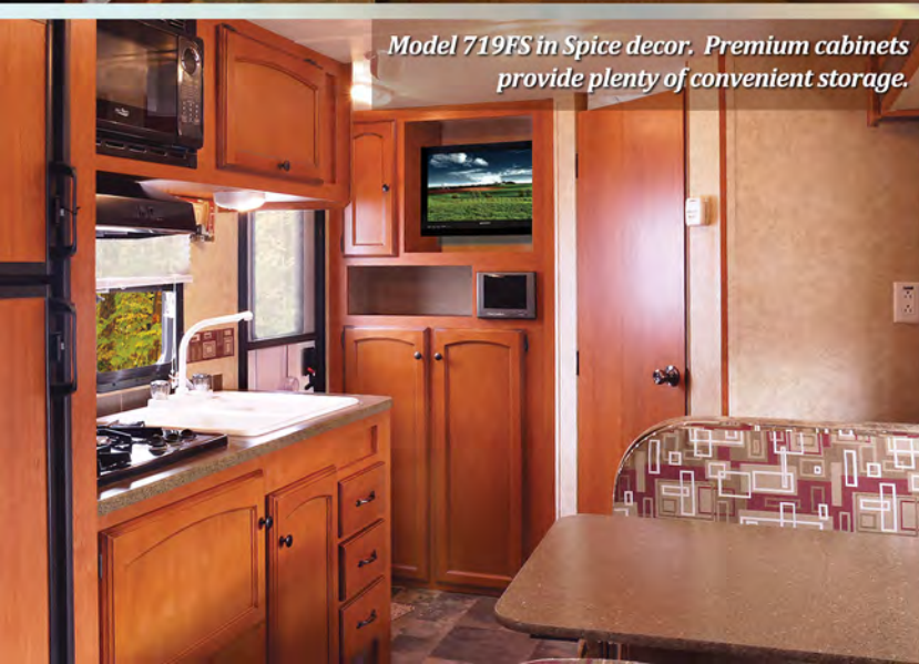
Model 719FS in Spice decor. Premium cabinets provide plenty of convenient storage.