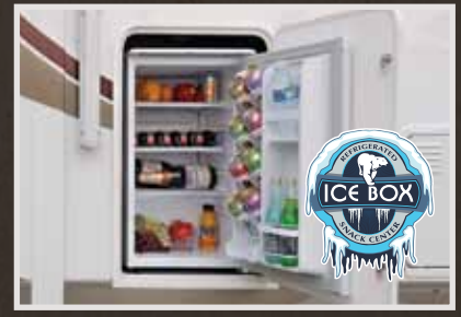
Sandpiper's "ICEBOX" is a quick and easy way to grab a cold snack and beverage without entering your unit.