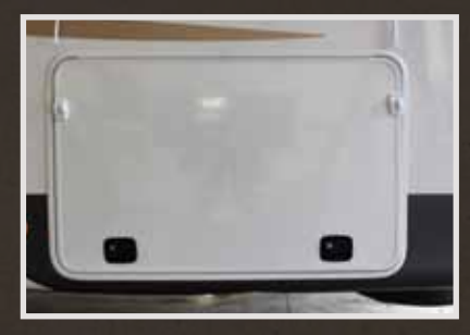
Insulated heavy duty Slam Lock baggage doors.