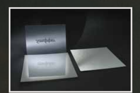
Gel coat fiberglass protects from UV rays and prevents yellowing and cracking.