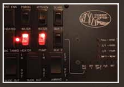
Sandpiper's command center allows you to monitor tanks and other systems quickly and easily.