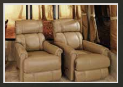
Relax in comfort in a La-Z-Boy.