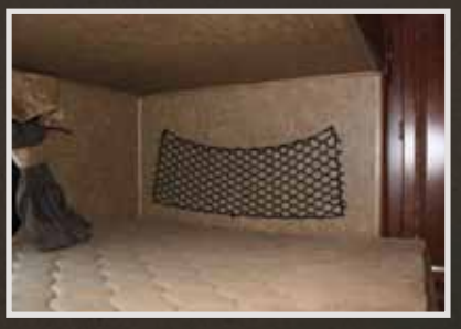
Cargo net in bunk area for storing extra gear.