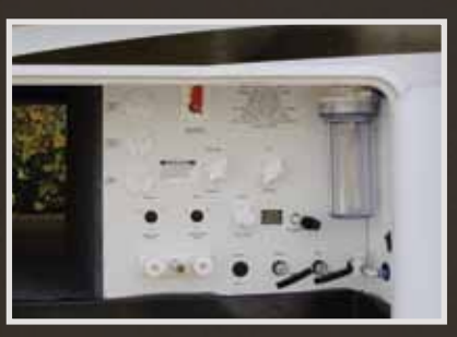
Sandpiper's convenient lighted outside docking station.