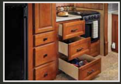
Kitchen drawers with full extension ball bearing drawer glides.