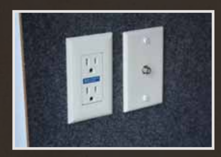
110v outlet and cable outlet conveniently located in the pass-thru storage area.