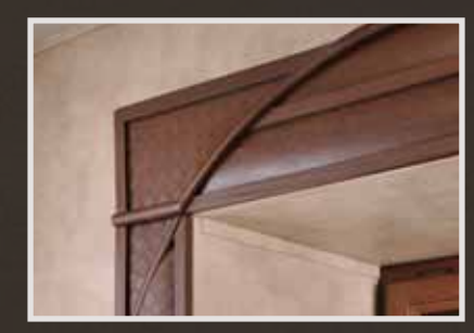
Handcrafted facia gives the slide-out a distinguished look.