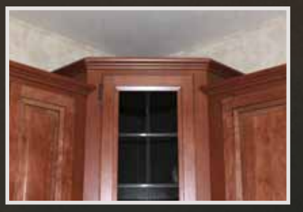
Raised panel cabinet doors with crowned molding found in the kitchen.