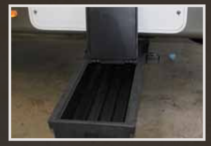
Optional under mount exterior storage bin keeps commonly used items close at hand.