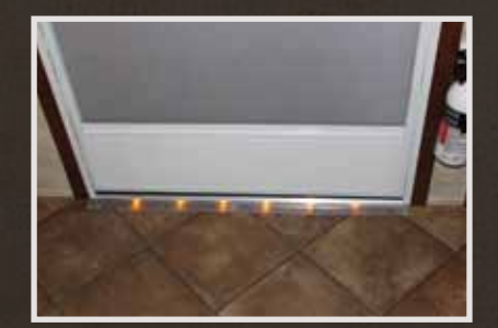
Amber threshold lighting at main entrance for added safety.