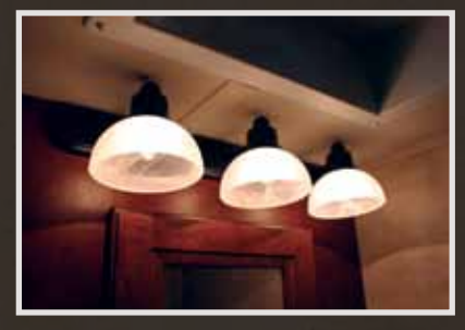
Contemporary light fixtures in bathroom.