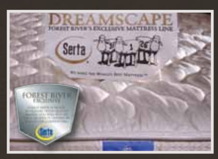
Serta<sup>™</sup> Dreamscape mattress is a Forest River exclusive feature.