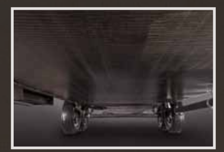
Heated and enclosed underbelly protects your coach and improved airflow allows for a sturdier ride.