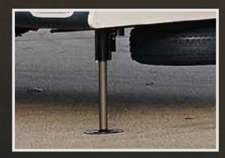
Wide stance power front jacks with quick release snap pins. (Optional hydraulic shown)