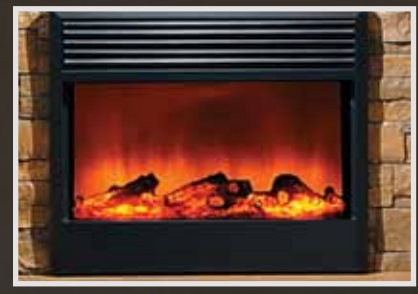
Enjoy the warmth and comfort of the electric fireplace.