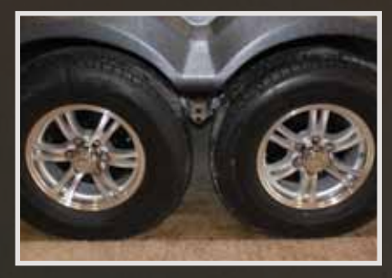
Contemporary aluminum rims with E-rated radial tires.