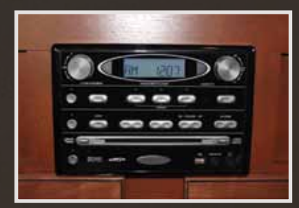
Jensen AM/FM CD/DVD stereo comes standard in the Sandpiper.