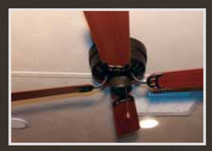
Contemporary ceiling fan.