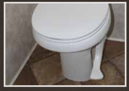
Porcelain foot flush toilet, easy to use, easy to clean.