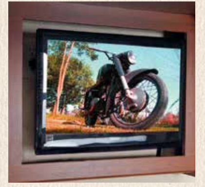
Inside/Dutside LCD HD TV