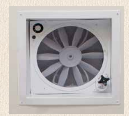
Kitchen Fantastic Fan

FUEL: 3D Gallon Chassis Mount Fuel Station with 12 Volt Pump on All Models