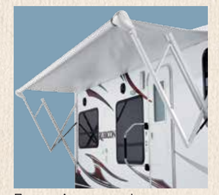
Power Awning with Adjustable Legs