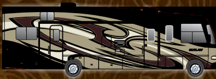
HIGH VOLTAGE FULL BODY PAINT