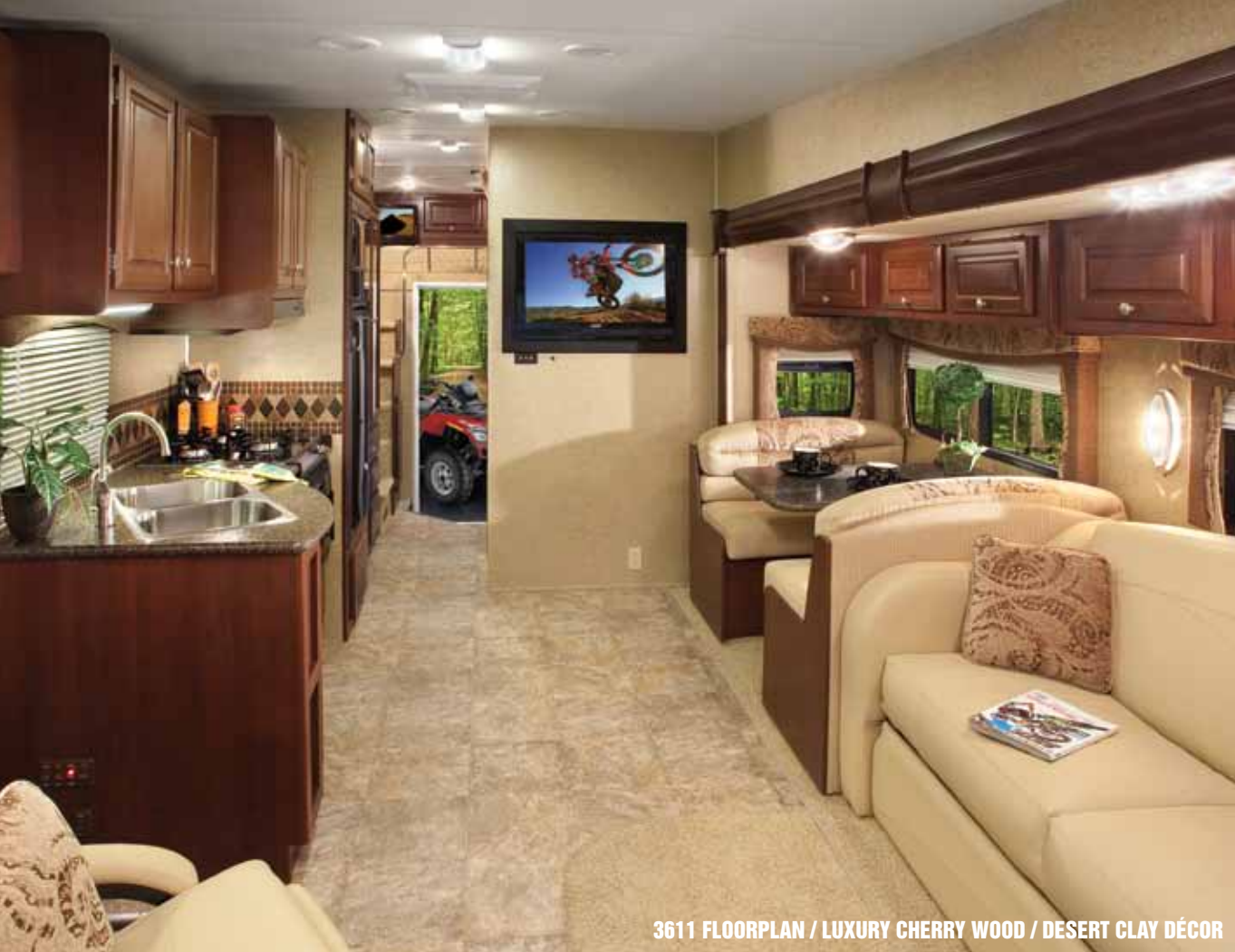
3611 FLOORPLAN / LUXURY CHERRY WOOD / DESERT CLAY DÉCOR