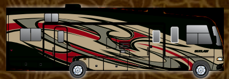
FIRE OPAL FULL BODY PAINT