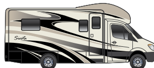
SATIN CREAM FULL BODY PAINT