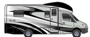
SILVER STORM FULL BODY PAINT