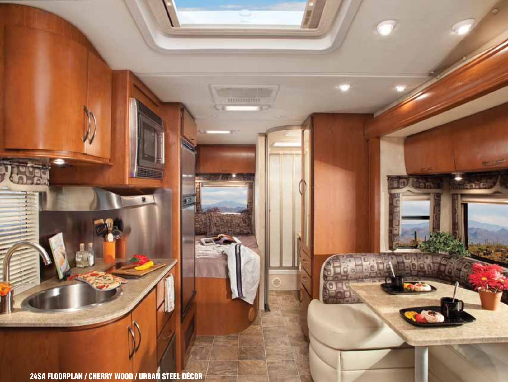
24SA FLOORPLAN / CHERRY WOOD / URBAN STEEL DÉCOR