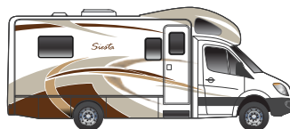
AUTUMN MAPLE PARTIAL PAINT