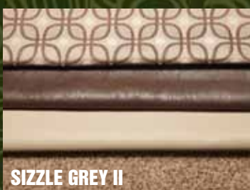
SIZZLE GREY II