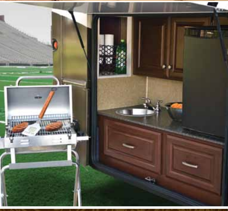
34KD FLOORPLAN / OPTIONAL EXTERIOR ENTERTAIMENT PACKAGE