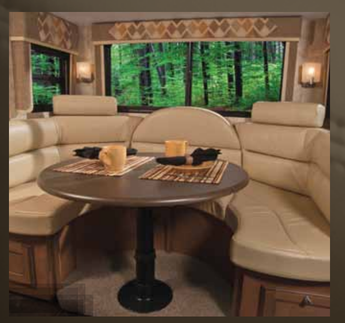
Roomy Enjoy meals or play cards with friends in the spacious U -shaped dinette.

The available Interior Upgrade Package takes things just a bit further: stylish appliqué for the dashboard, carpet floor mats, intimate rope lighting as well as an elegant galley backsplash, MCD American Duo<sup>®</sup> solar/blackout roller shades, and the addition of the Dream Dinette<sup>™</sup> table that easily adjusts to the perfect height with just one hand (30C).