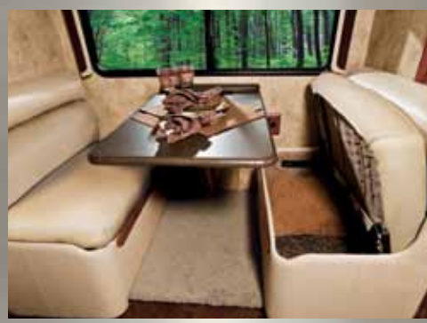
Multi-Tasking The BenchMark full-comfort dinette is a premium dining set, has innerspring seat construction for residential-style comfort, easy flip-up storage and provides a comfortable bed when needed.