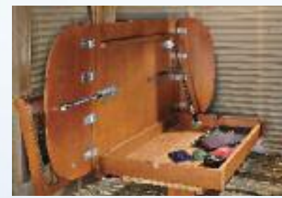
Hide games, placemats and more in this innovative under table top storage area. Extendable dual leaves and a sliding base provide extra room. There's even storage under the seats!

3710BH Wired for games, this familyfriendly bunkhouse has flush-floor slides and ample room to sleep five happy campers. Fold-down bunks and a 68" hide-a-bed sofa with an air mattress stow away. The storage area features two wardrobes with sliding mirrored doors, netted overhead storage for pillows and blankets plus plenty of drawer space. The bunk house also has an adjoining half bath. (Optional 32" LCD with an articulating swing arm, shown.)