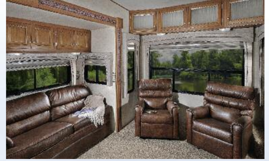
3025 RL These large picture windows and facing flush-floor slide outs create an open, airy atmosphere. The 68" hide-a-bed sofa with air mattress and recliners are shown in optional Cognac soft-touch leather.