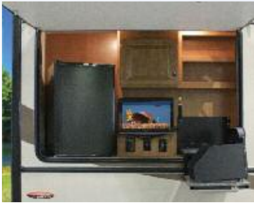
The Blue Ridge 3710BH's exterior kitchen feature with a two-burner LP stove, flat-screen LCD TV and refrigerator enhances any outdoor cooking experience.