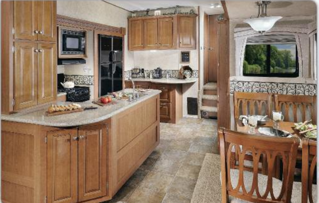
3600RS Blue Ridge floorplans are all loaded with ample storage - even under the chairs and dinette table! (Optional 12 cu. ft. 4 door refrigerator shown.)