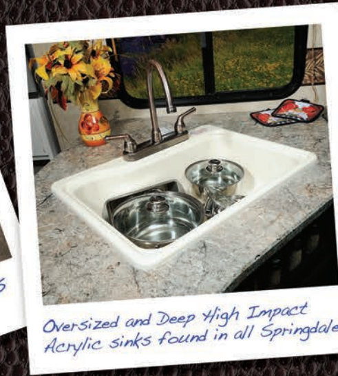
Oversized and Deep High Impact Acrylic sinks found in all Springdales