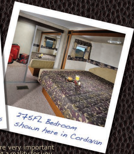
275FL Bedroom shown here in Cordavan

At Springdale we know that convenience and comfort are very important when you are on your Adventure and we strive to make that a reality for you. The Galley's make prep work to cleanup effortless. All Springdales have full extension pull out drawers and deep sinks that make the most experienced camper happy. Large bedrooms and room to roam in the main living areas make the Springdale easy to navigate for the entire camping crew!