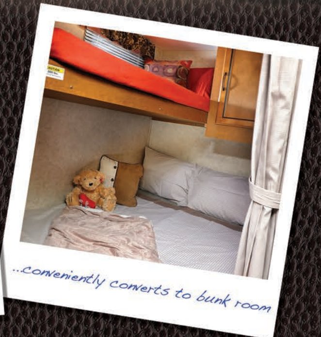
...Conveniently converts to bunk room