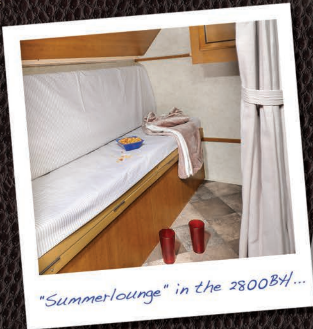
"Summerlounge" in the 2800BH...

Why not have exactly what you want to go camping and do it with style and grace? Summerland by Springdale offers a great look and awesome features at a price that will fit any budget. Versatile floorplans, a variety of sizes, and packed with so many features you will not want to stay home! Summerland has what you want to begin your Adventure!