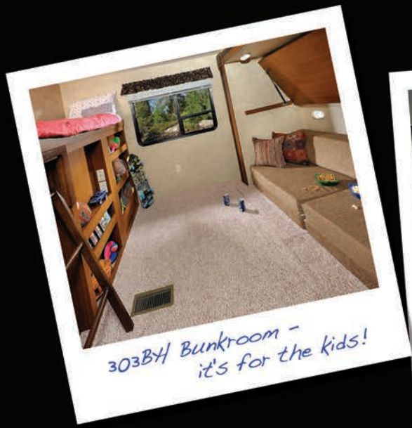
303BH Bunkroom - it's for the kids!

You not only want to feel good while camping you want to look good too, Springdale went all out for this Adventure. Our interiors capture the true essence of modern and contemporary style blended with progressive accents that will make you the envy of the campsite. Form and function do meet with Springdale. Whether it's large bunkrooms, or large