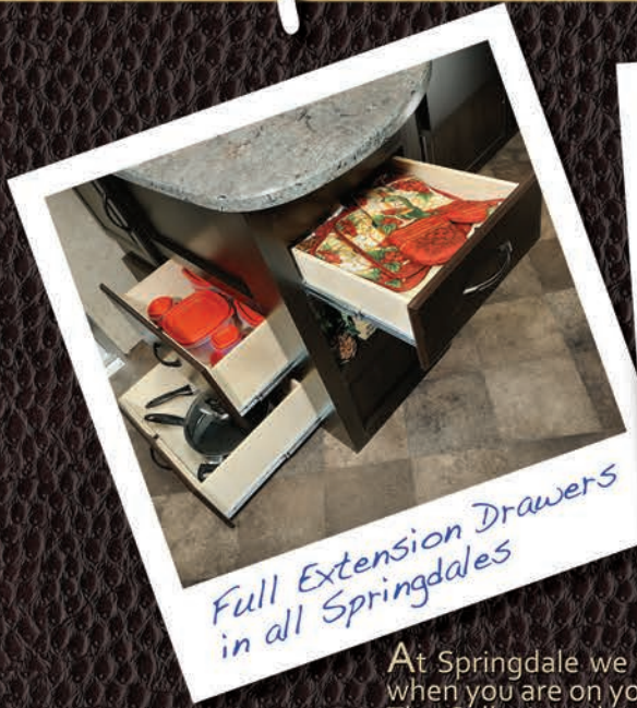
Full Extension Drawers in all Springdales