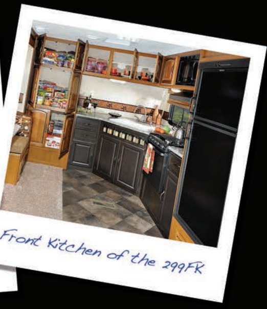
Front Kitchen of the 299FK