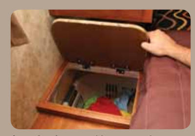
Laundry chute provides a convenient place to dispose of dirty clothes until you get home.