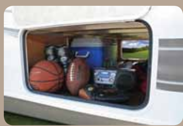
Largest pass-thru storage in its class. 40.3 cubic ft. of storage provides an abundance of space for all of your camping gear.