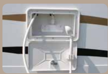
Exterior shower comes equipped with a fixed shower head and access to both hot and cold water.