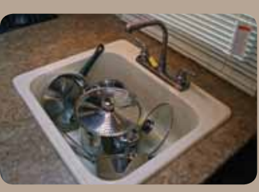
9" Single Basin Kitchen Sink allows enough size and depth for washing pots