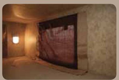
Blackout shades provide a durable, kid-friendly alternative for blocking out sunlight.