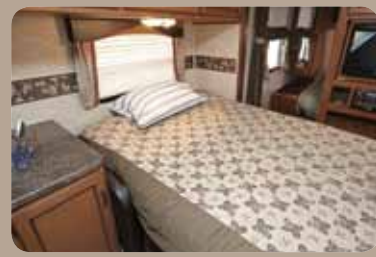
Air Bed Sofa offers a relaxed place to lounge Swivel TV (per floorplan) eliminates the during the day and gives your guests a comfortable sleeping option at night.