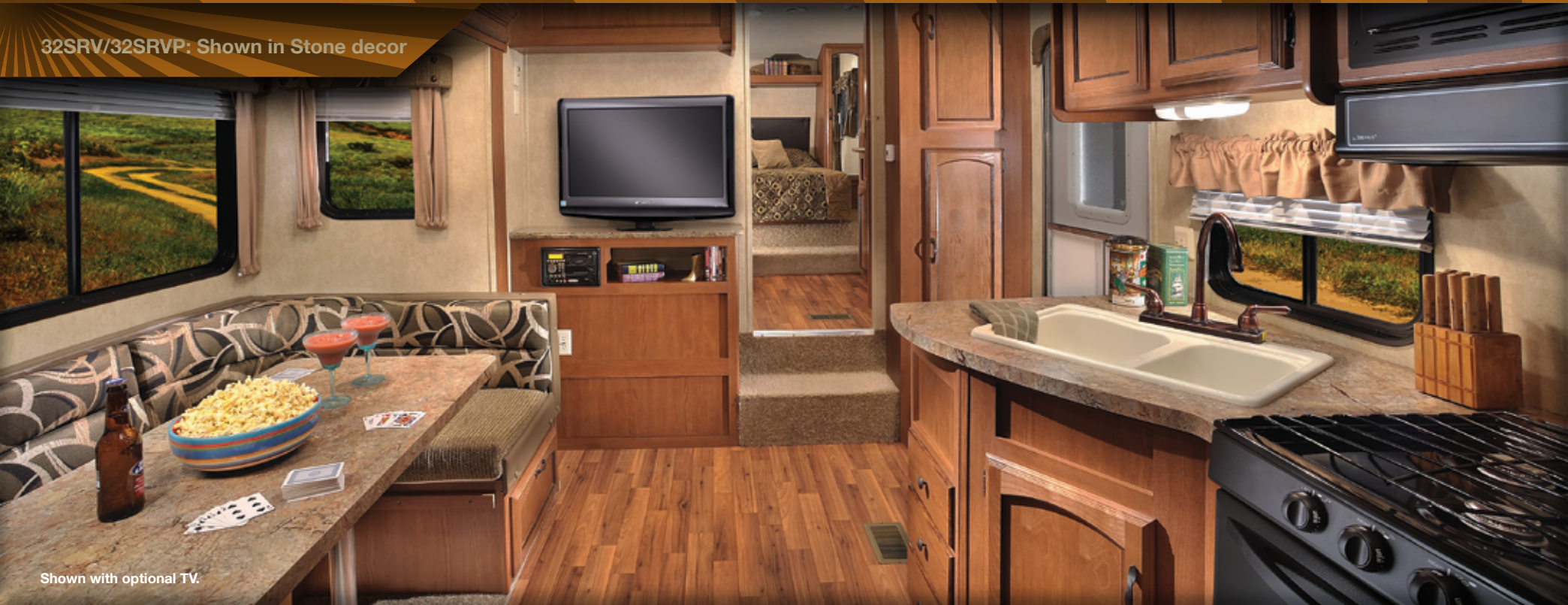
Shown with optional TV.