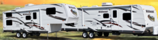
LODGE Wildwood DLX