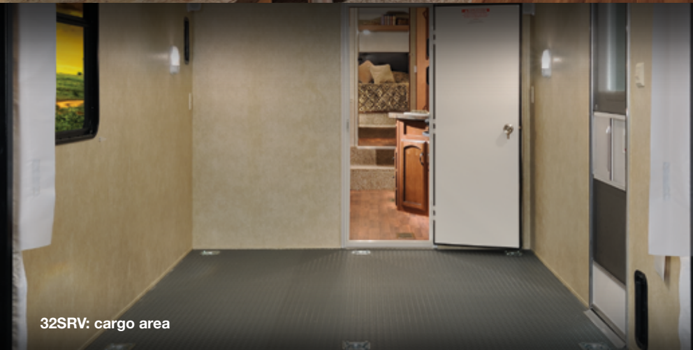
32SRV: cargo area