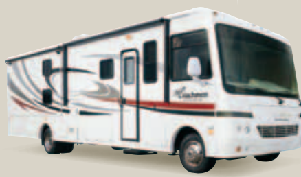
Oxford Onyx Graphics