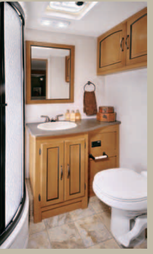
The Mirada's luxury bath area bring the comforts of your home with you on the road.