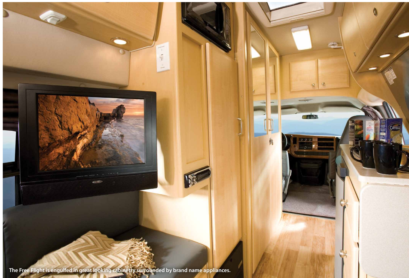
The Free Flight is engulfed in great looking cabinetry surrounded by brand name appliances.