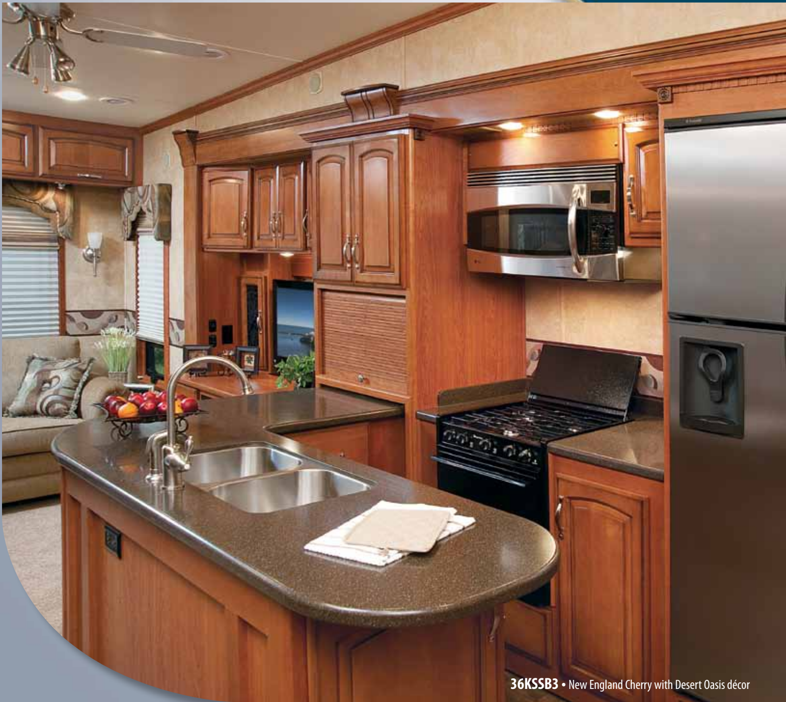
36KSSB3 • New England Cherry with Desert Oasis décor