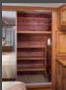
Cedar-lined closet with built in shoe rack.