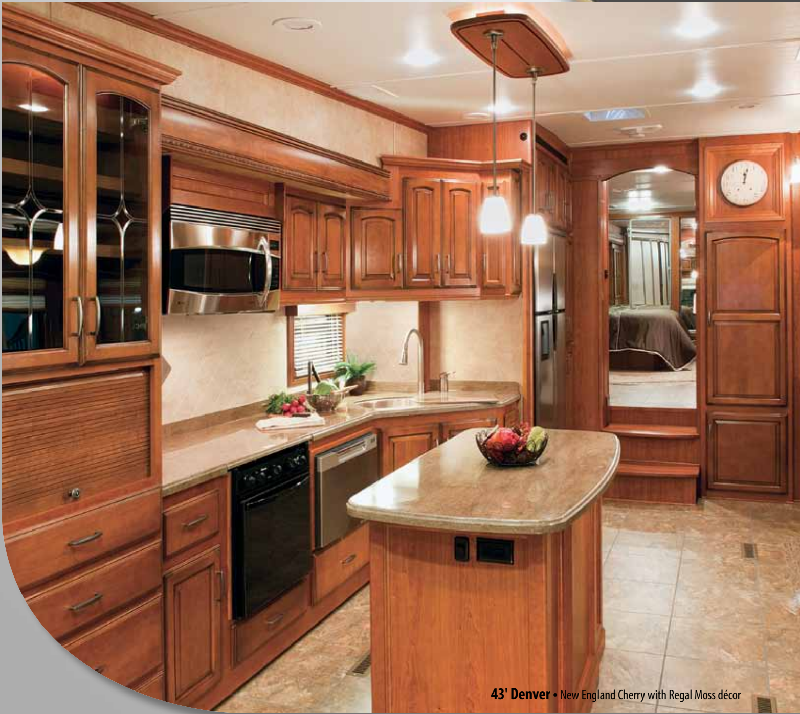
43' Denver • New England Cherry with Regal Moss décor