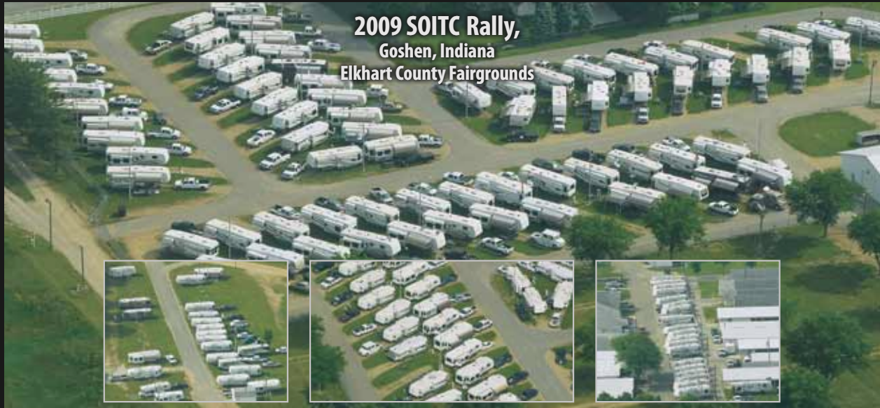
2009 SOITC Rally, Goshen, Indiana Elkhart County Fairgrounds