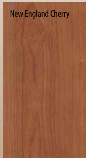
New England Cherry