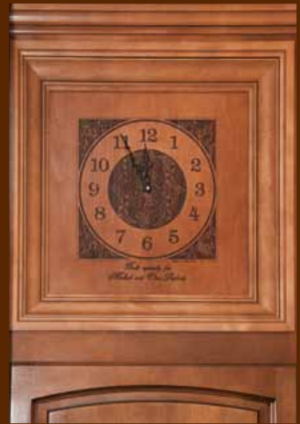
Personalized hardwood wall clock.

Custom hand made and finished woodwork and cabinets are exclusively made for the Elite Suites and feature the rich look of New England Cherry cabinetry.