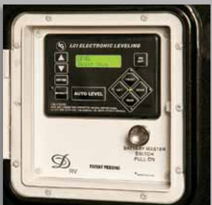
Optional one-touch auto leveling.