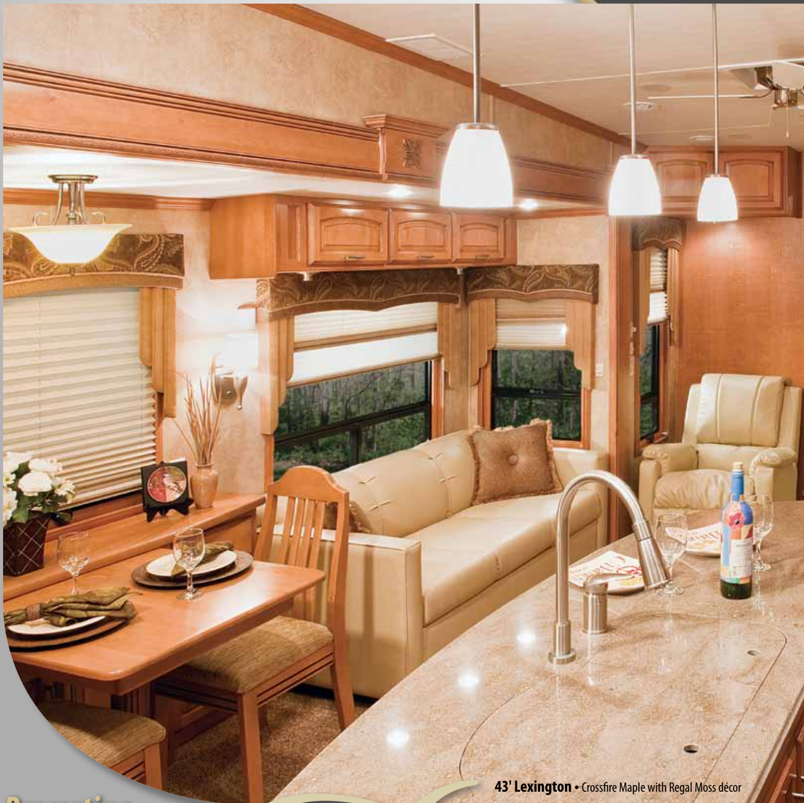
43' Lexington • Crossfire Maple with Regal Moss décor