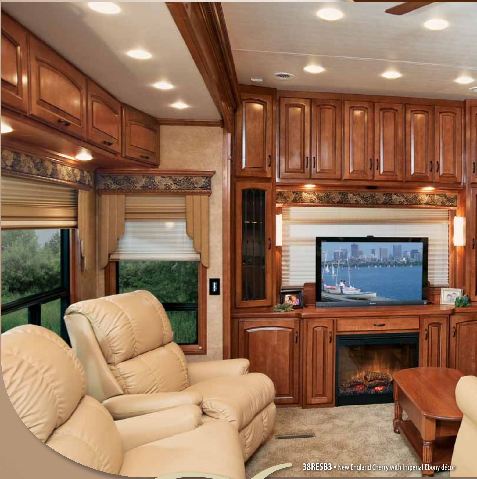
38RESB3 • New England Cherry with Imperial Ebony décor