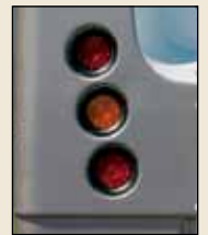
Automotive L.E.D. stop, turn, tail and clearance lights for reliability, greater visibility and safety.