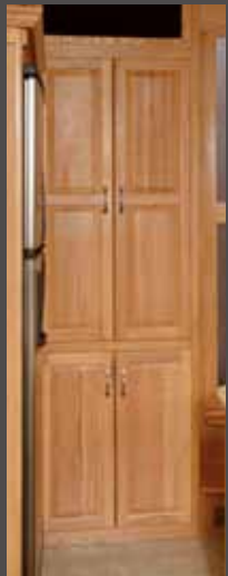
Your bounty of pantry space will always be well organized with the upper track-glide shelf unit. Shown in Suite Oak.