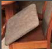
Dinette chairs with under-seat storage.