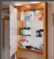
Large mirrored medicine cabinet.