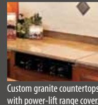
Custom granite countertops with power-lift range cover.