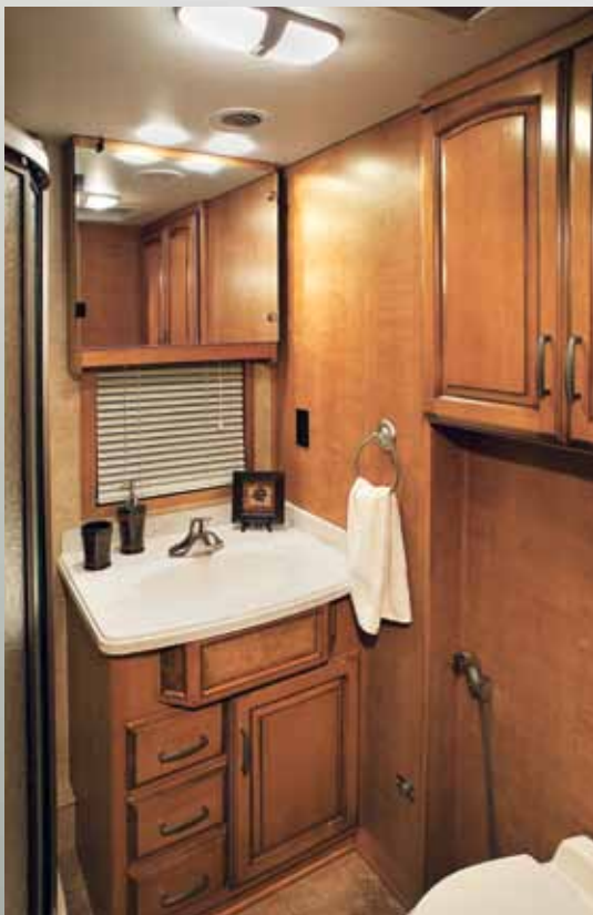
Spacious bath with full radius front shower.