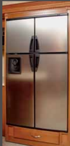
Extended-stay means greater capacity and you'll have it in this residential-style four door refrigerator/freezer featuring easy care stainless steel front.