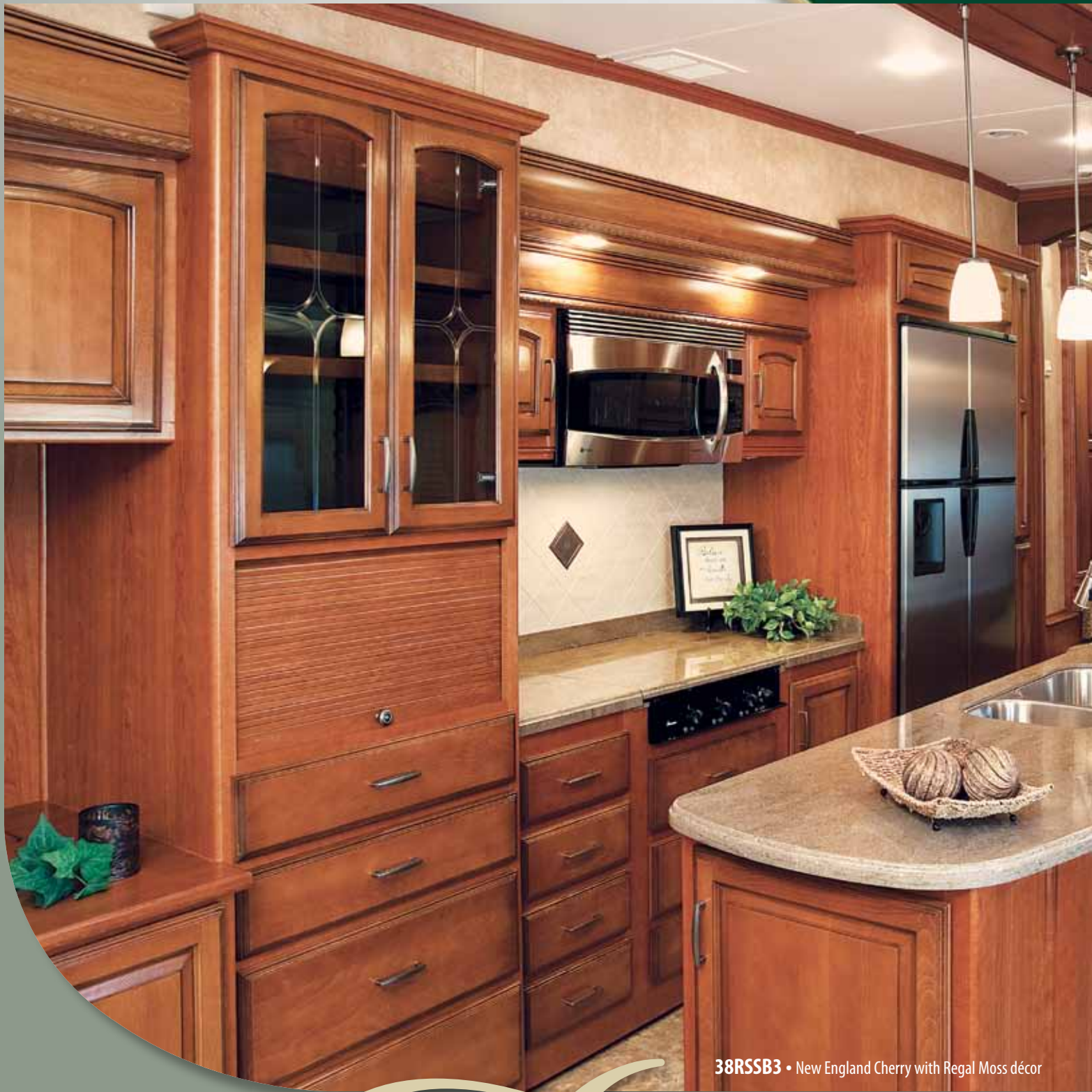
38RSSB3 • New England Cherry with Regal Moss décor