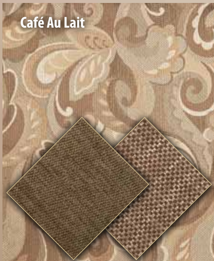
Café Au Lait

The straight roofline design means greater ceiling heights and storage throughout.