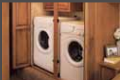
Front load washer/dryer for at home convenience.