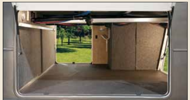
Abundant basement storage for extended living.