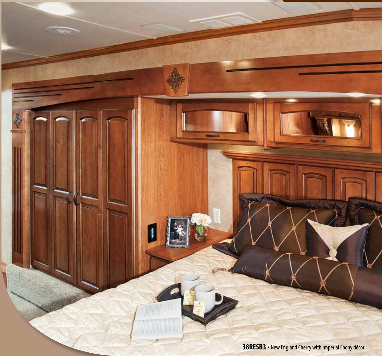
38RESB3 • New England Cherry with Imperial Ebony décor

The King Sleep System features a Sleep Number® bed by Select Comfort™ and a lift assist under-bed storage space.