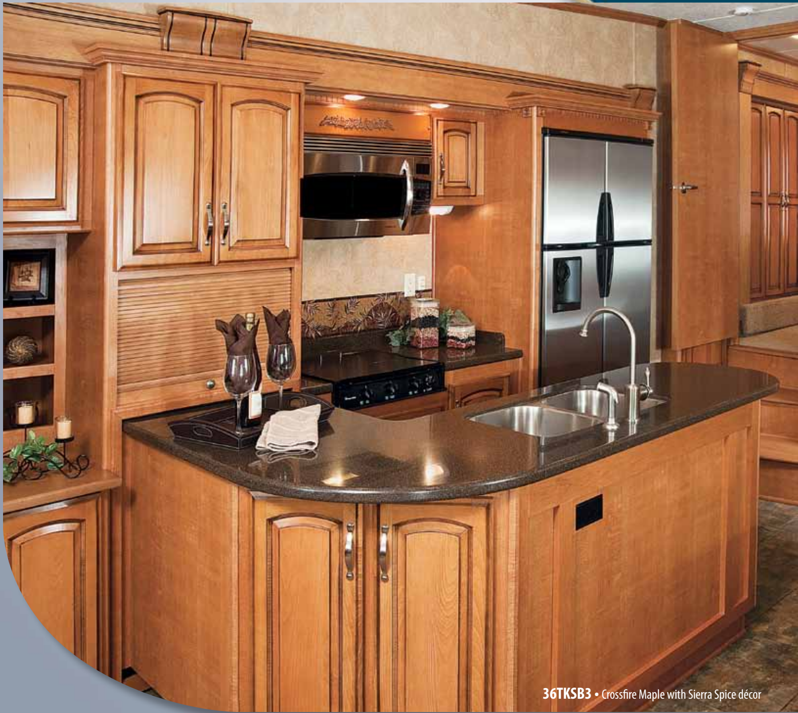
36TKSB3 • Crossfire Maple with Sierra Spice décor