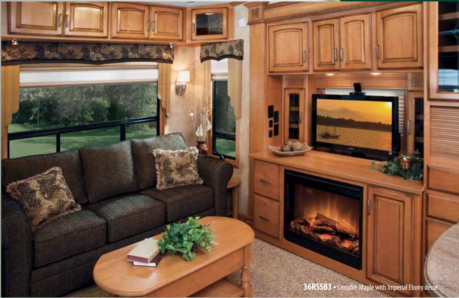
36RSSB3 • Crossfire Maple with Imperial Ebony décor