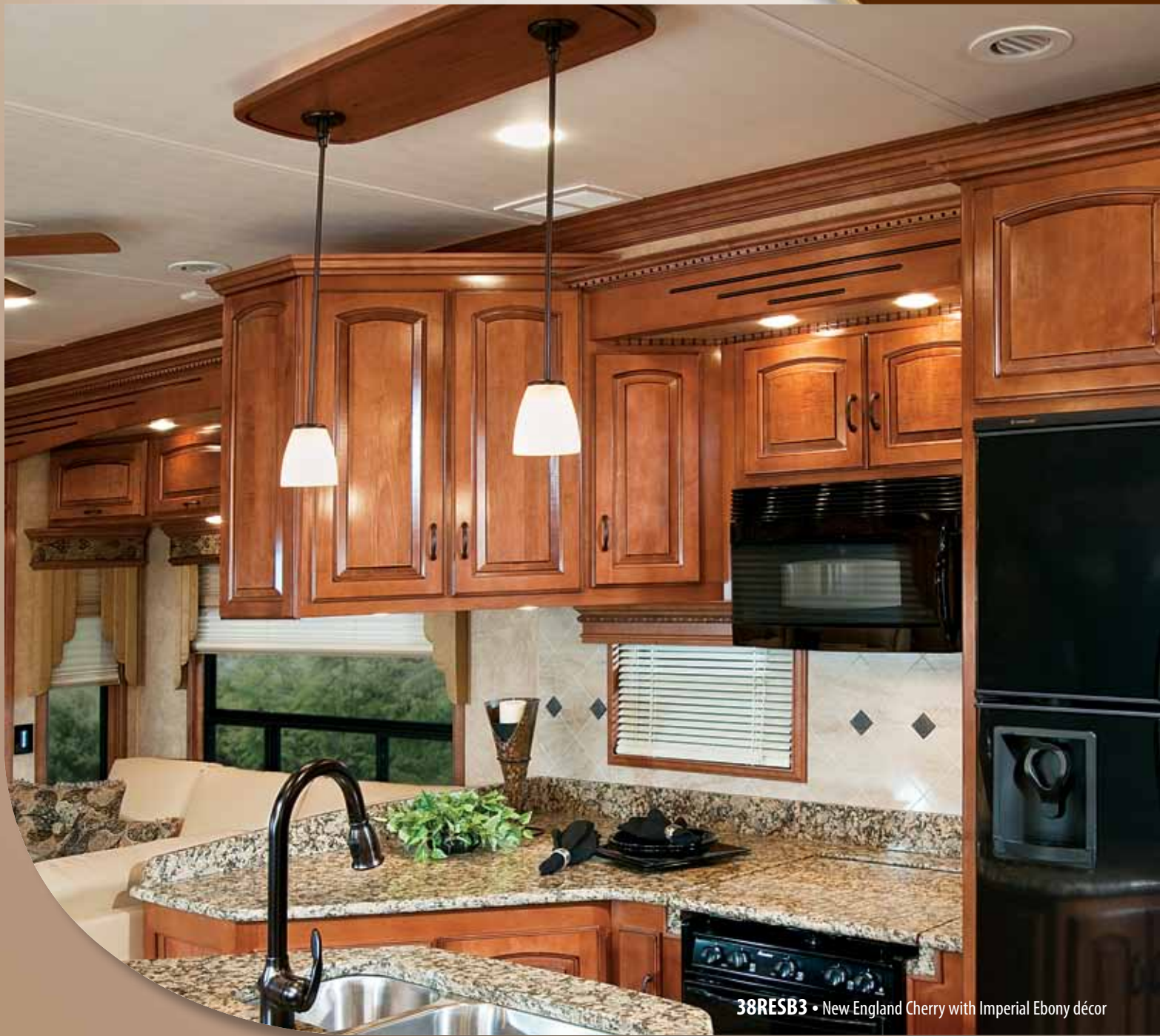
38RESB3 • New England Cherry with Imperial Ebony décor