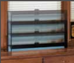
Hide-a-way power lift TV.