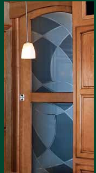
Etched, smoked glass pocket door detail.