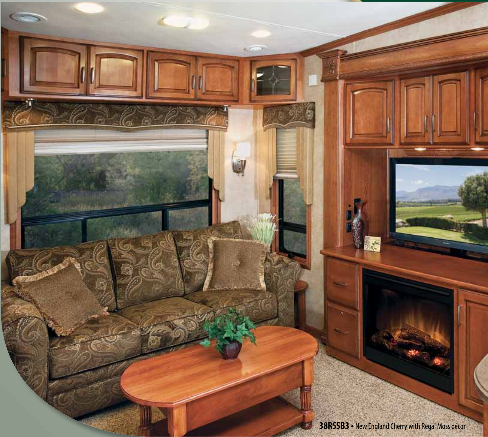
38RSSB3 • New England Cherry with Regal Moss décor