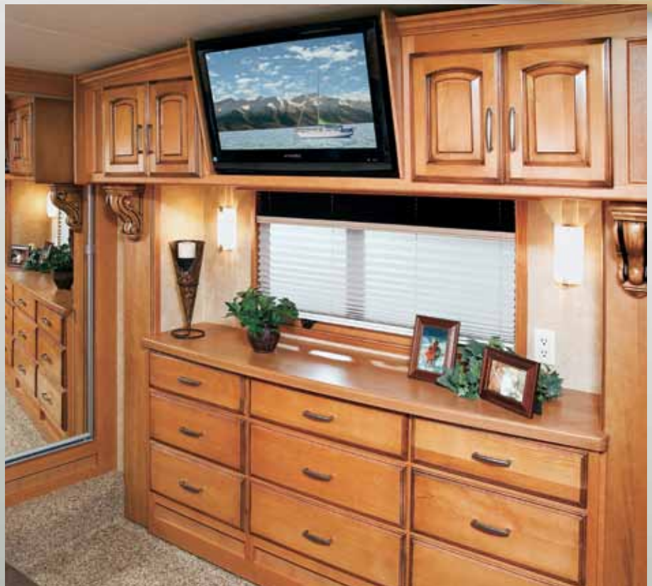
Optional vanity slide out, available in most models, increases floor and wardrobe space.