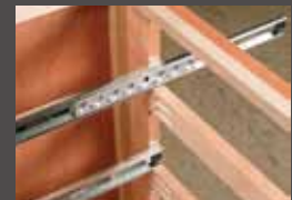
All metal residential style "full extension" drawer guide system – screwed securely, not stapled.