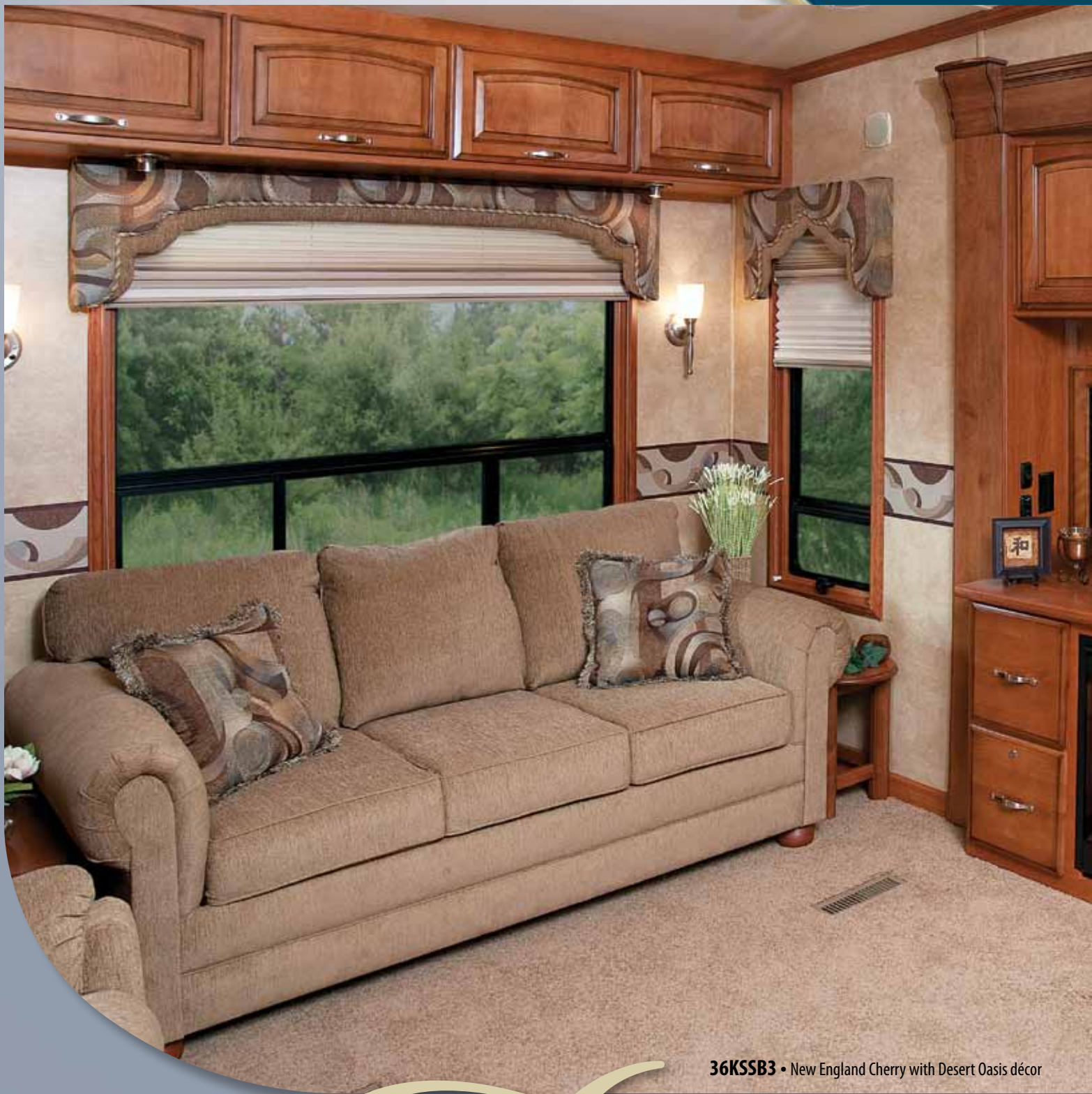
36KSSB3 • New England Cherry with Desert Oasis décor