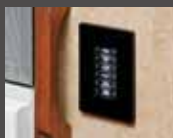
Multi-Plex lighting system touch control.