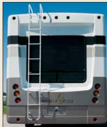
Contemporary design fiberglass rear cap and detachable ladder.