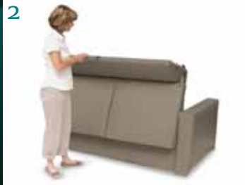
Comfort Sofa Sleeper This 2-in-1 sofa, available in the 30C, redefines comfort and convenience.