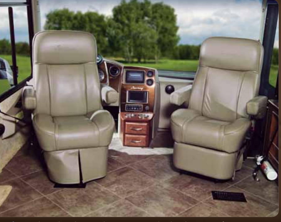
Cab Seats UltraLeather cab seats with six-way power pedestals and a passenger foot rest come standard in the Journey and are available in the Journey Express.

Driving is just more fun with advanced features such as the TRW<sup>®</sup> tilt/telescopic steering column. The RV Radio<sup>®</sup> with iPod/ MP3 input and weather band is standard and features a 6.5" LCD monitor that also displays the rearview and sideview color camera images. Choose the in-dash GPS navigation system for a 7" touch screen radio and a second dash monitor that can be viewed from the passenger seat. You can enhance your listening options by adding the Sirius® satellite radio system. It includes an iPod interface connector, docking port and a complimentary six-month subscription.