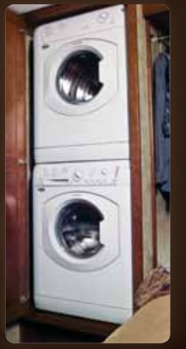
Washer/Dryer You'll appreciate the ability to do laundry on the road when you add the stacked washer and dryer on the Journey or washer/dryer combo on the Journey Express.