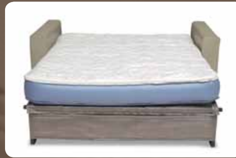
4) The mattress inflates and deflates with an automatic pump.