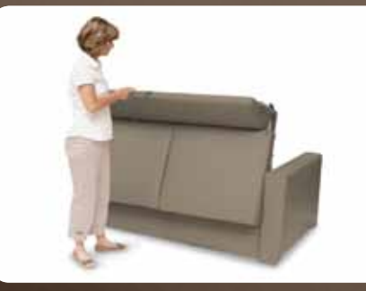
3) It converts easily into a bed.