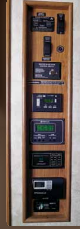
OnePlace Frequently used switches, gauges and controls are all placed on this centrally located panel.

Avoid tripped campground circuit breakers, thanks to the PowerLine® energy management system that monitors 110-volt power usage and cycles appliances on and off as necessary.