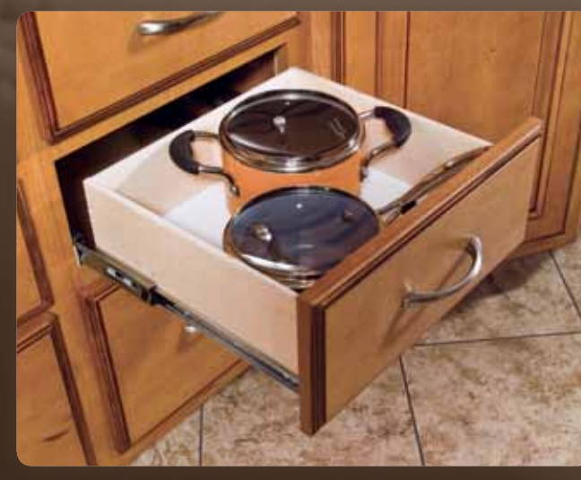
Full-Extension Drawers Drawers are sized to maximize storage and open wide on full-extension slides for easy access.