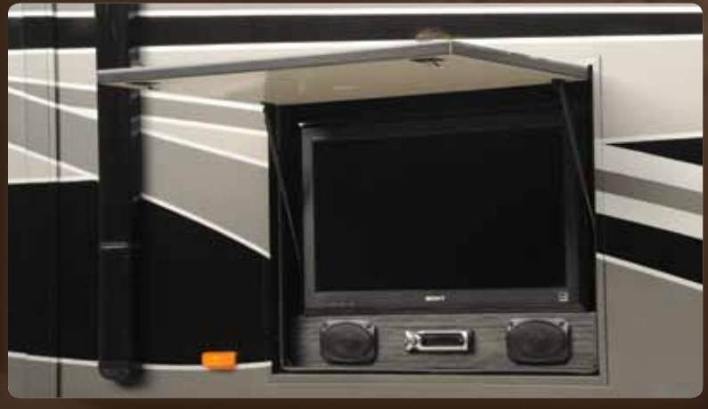
Entertainment Center The available exterior entertainment center features a 32" LCD HDTV, DVD player and stereo and is positioned above the belt line for optimal viewing.