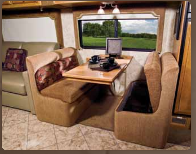
Dinette The BenchMark full comfort dinette (NA 40U) has seats with innerspring construction for added comfort. They flip up for easy access to storage and the dinette quickly converts into a bed.