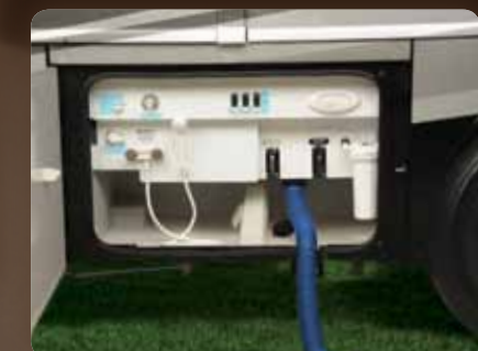
Exterior Service Center Color-coded labels make hookups a snap.