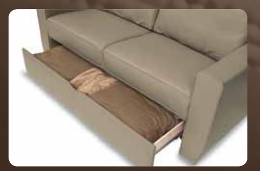
2) A hidden drawer stores bed linens.