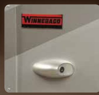
Sideview Cameras Sideview cameras activate with the turn signal to aid with navigation.