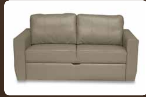
1) By day it's a plush sofa.

Comfort Sofa Sleeper This sofa in the 40L easily folds out into a bed with a self-inflating mattress.