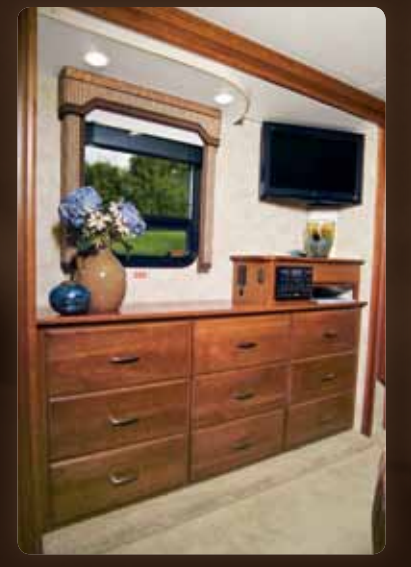
Storage A large dresser provides ample storage for a complete wardrobe.