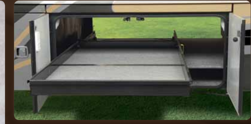
Slideout Tray A spacious 90" slideout tray is available on the Journey 40L and 40U. It can be pulled out on either side of the coach for easy access.