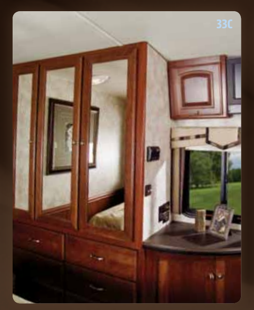
Bedroom Storage You'll have plenty of room for your clothes thanks to the abundant wardrobe space and large drawers.

Make your way to the rear of the coach to bask in the serenity of the private bedroom with a walkaround queen bed. A king bed comes standard on the 35J and 37L and is available on the 33c and 36V. After a soothing shower in the spacious bathroom, kick back and watch movies or shows on the available LCD TV. Connection points built into the wall make it easy to add a DVD player. Choose the versatility of bunk beds, featured in the 35J, and you can also add DVD/LCD players in each bunk so that each traveler has a space of his or her own.