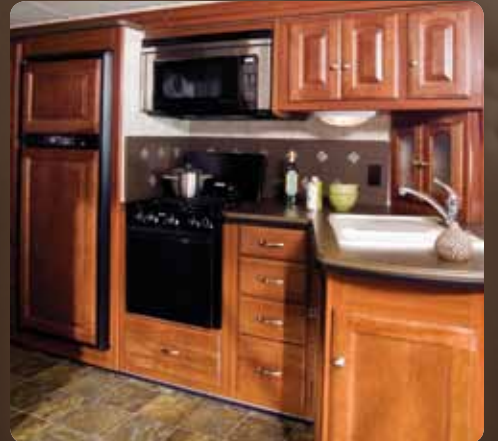
Galley A decorative backsplash accents the countertop and sink covers. The 31E and 35J include a flip-up countertop extension for even more prep space.