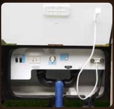
Service Center Controls are easily accessible and color-coded labels make campground connections a snap. Quickly rinse off sandy shoes or wash a pet with the standard exterior wash station.