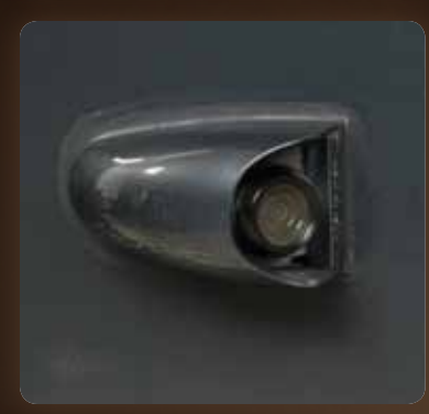
Available sideview color cameras activate with the turn signals and display on the dash-mounted LCD monitor to assist with maneuverability and visibility.