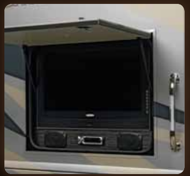
Entertainment Center Add the exterior entertainment center to enjoy CDs, AM/FM stereo and the 32" LCD TV under the available powered awning on the 33C, 35J, and 36V (NA 35J with range/ oven option).