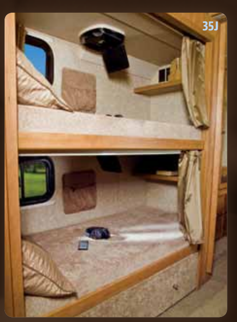
Bunk Beds Kids will love the bunk beds in the 35J.