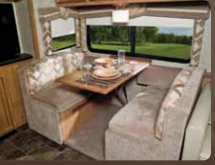
BenchMark The BenchMark® full-comfort dinette (NA 37L) features seats with innerspring cushions for maximum comfort. They also flip up to reveal easy-access storage and convert into a comfortable bed.