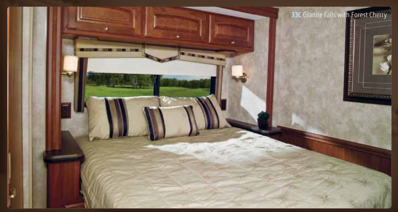
Storage The bed lifts up to reveal a large storage compartment.

TrueLevel™ tank monitors use sonar technology to accurately measure tank levels. Without probes that clog or corrode, you'll enjoy accurate readings time after time.