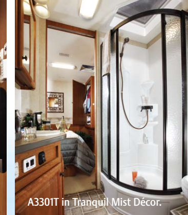
A3301T in Tranquil Mist Décor.

The A3501D floorplan provides a space we've designed with the younger travelers in mind. An optional 19" LCD TV DVD combo unit can be installed opposite the bunks which convert to a comfy sofa by day.