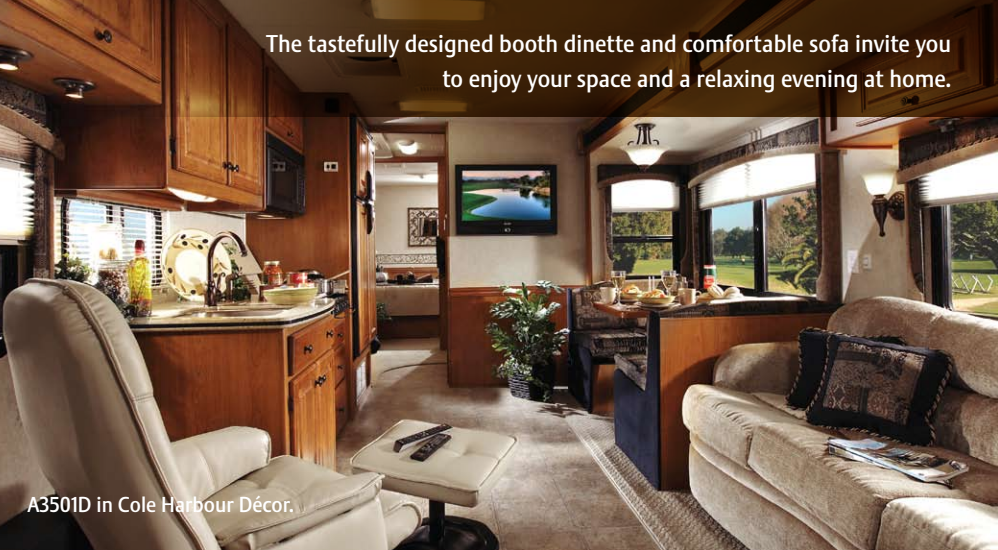
A3501D in Cole Harbour Décor.