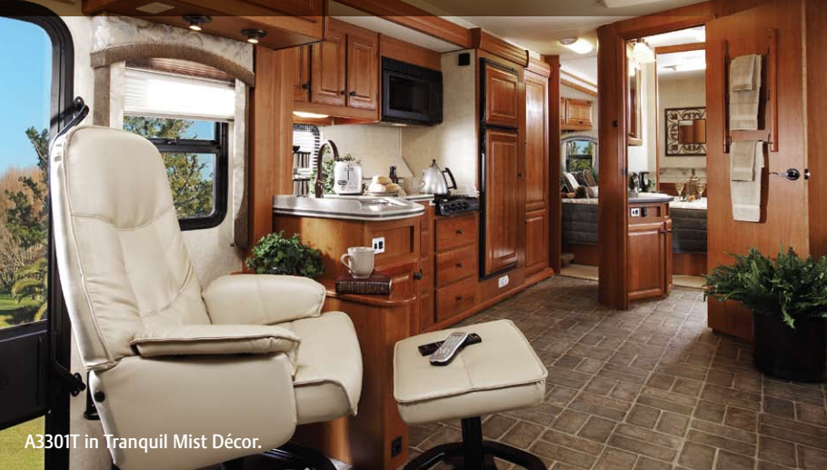
A3301T in Tranquil Mist Décor.

With its fresh new look, the A3301T floorplan offers an abundance of amenities, not the least of which is a spacious and well-lit galley. You may also find yourself drawn to the unique styling of the lavatory, complete with a skylight, rounded shower, curved cabinetry, and its accessibility from both the main living area and bedroom.