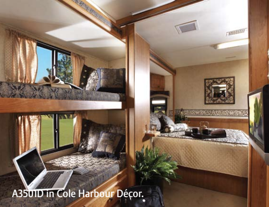
A3501D in Cole Harbour Décor.