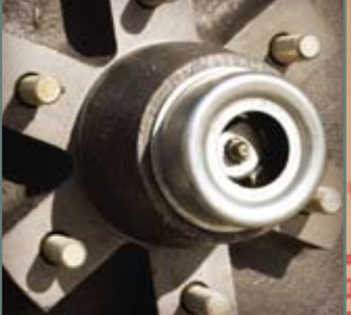
■ EZ Lube<sup>™</sup> axles are higher quality than most. They feature lower maintenance and more durability.