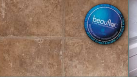
All Sunset Creek coaches have standard "Beauflor" - a new flooring dimension. It is resistant to mold & mildew, cold cracking, slipping and stains. The surface is an engineered composite that is also highly resistant to tears, rips and gouges. The best of all worlds in a Sunset Creek!