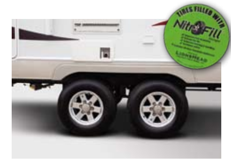
Tires on all Sunset Creek models are filled with nitrogen. It provides improved fuel economy; tire life, braking and handling, and safety.