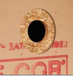
Along with R-7 insulation, we give you, at no extra charge, quality Fome-Cor® insulation for a cozier trailer.