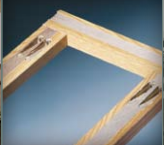
All Sunset Creek cabinet frames are screwed together. This provides a stronger product than stapling.