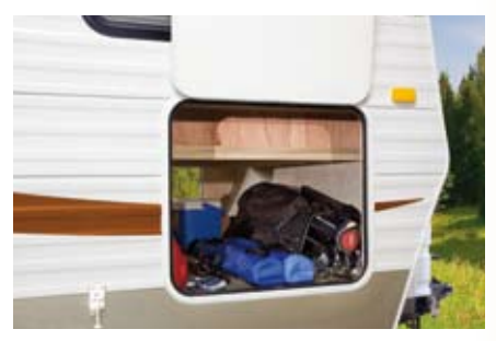
Extra large, pass-through storage is standard on most floorplans. This finished compartment is lockable.