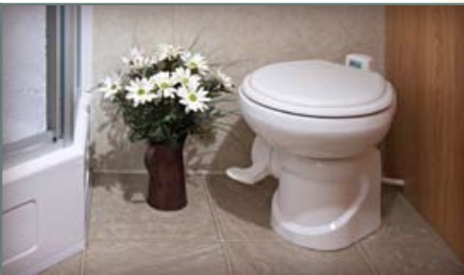
Other brands come with cheap plastic toilets. Sunset Creeks have porcelain foot-flush toilets standard!