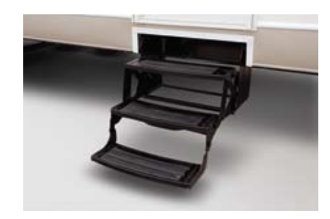
All Sunset Creek Travel Trailers offer a three-step entry way as standard equipment.