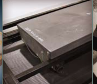
Heated and enclosed holding tanks are standard. They're optional or not even offered on most other brands.