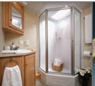
■ Bathrooms feature tub surround, skylight, power vent and glass shower door. Shown in Golden Oak cabinetry.