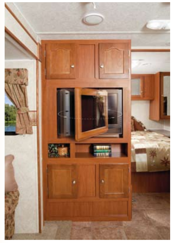
This movable TV eliminates the need for additional units and is yet another innovation of Sunset Creek. The convenient swivel TV in our entertainment center allows view-ability from the kitchen, living areas and/or bedroom.