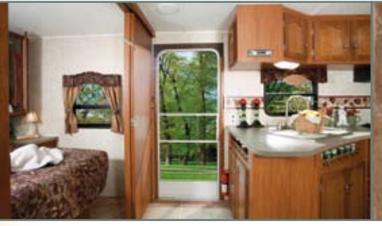
Main exit doors now have a sliding "clear pane" covering the door handle/lock area providing complete outside visibility - no longer do you have that solid color covering. A "Poodle Panel" is at the bottom of the door to keep your pets from scratching that nice screen door.