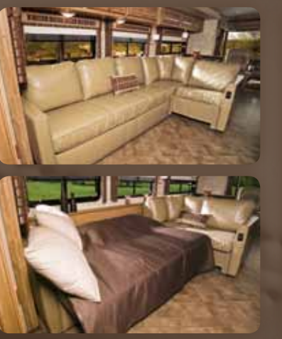
Sectional Sofa The sectional sofa extends for additional seating and folds out to provide an extra-large sleeping space.