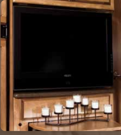
LCD TV The large LCD TV in the 35F is perfectly positioned for viewing from the sectional sofa.